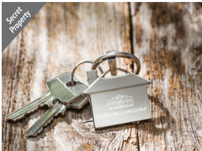
Modern old town apartment in Palma