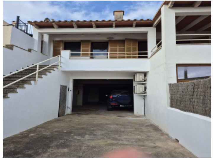
Garage and patio