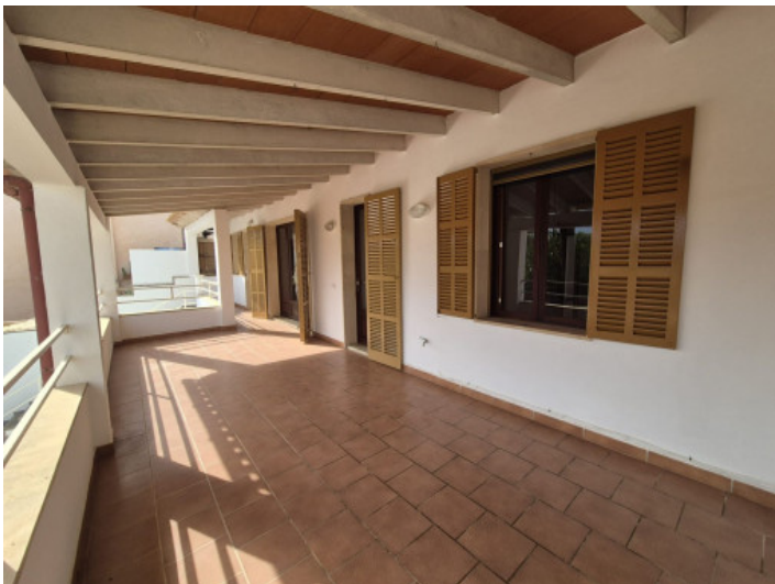
Terrace with stairs leading to the patio