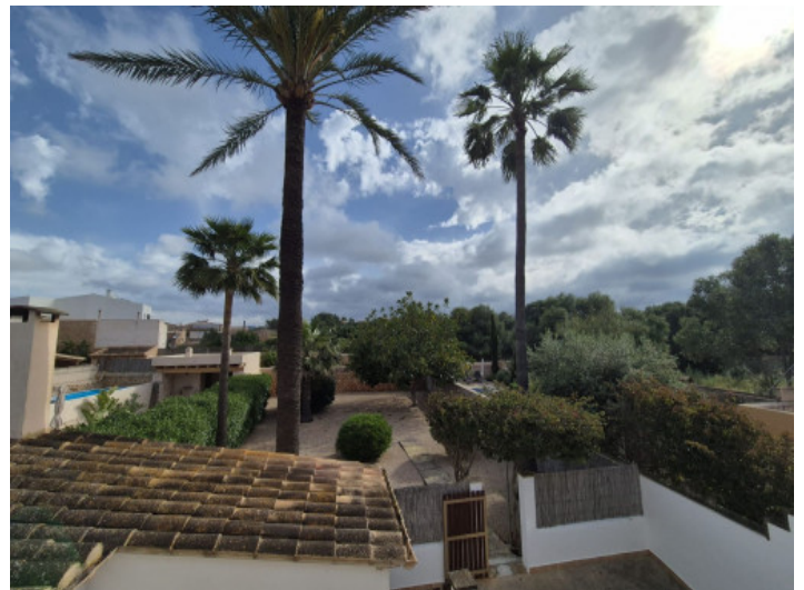
Views over the garden