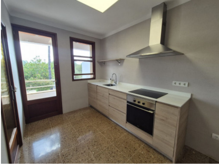
Kitchen with access to the terrace