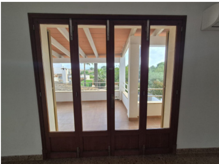
Access to the terrace