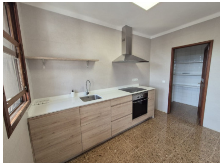
Kitchen with pantry

All information is correct to the best of our knowledge. Errors and prior sale excepted. This prospectus is purely for information purposes. Only the notarized deed of sale is legally binding.