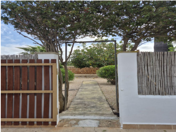
Acces to the garden