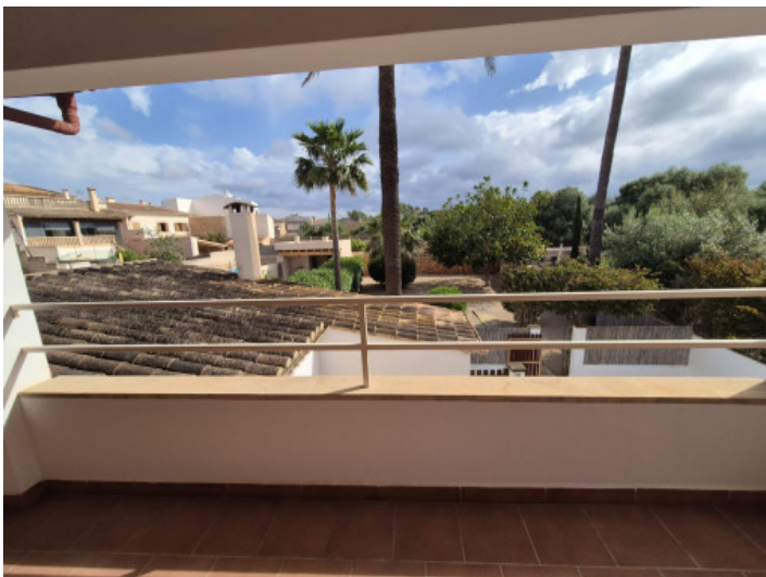
Terrace overlooking the garden