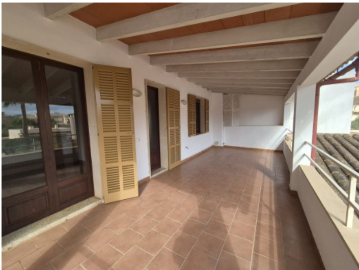
Large terrace with privacy