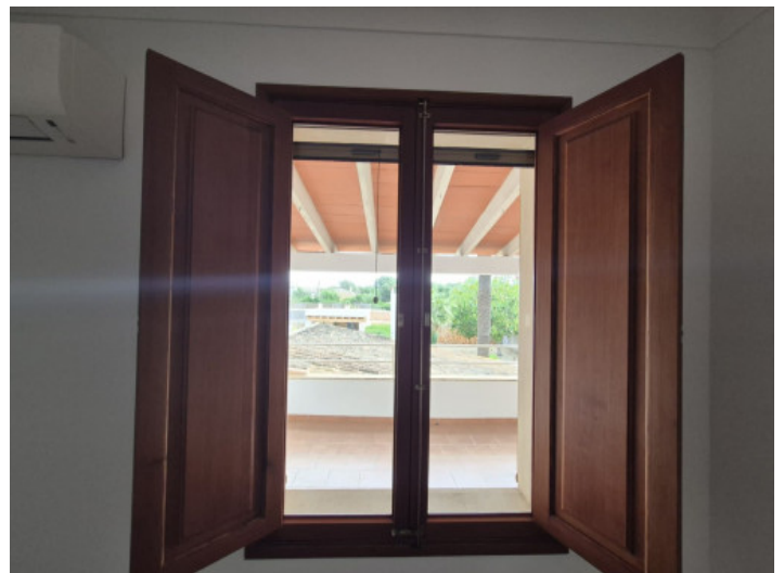
windows with blackout blinds

All information is correct to the best of our knowledge. Errors and prior sale excepted. This prospectus is purely for information purposes. Only the notarized deed of sale is legally binding.