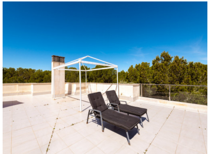
Large rooftop terrace