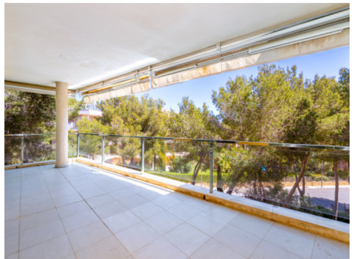
Covered terrace on the living level

All information is correct to the best of our knowledge. Errors and prior sale excepted. This prospectus is purely for information purposes. Only the notarized deed of sale is legally binding.