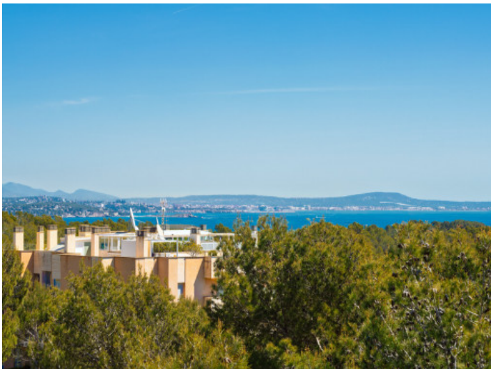
Partial sea view from the rooftop terrace