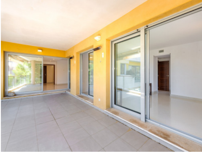
Covered terrace on the living level