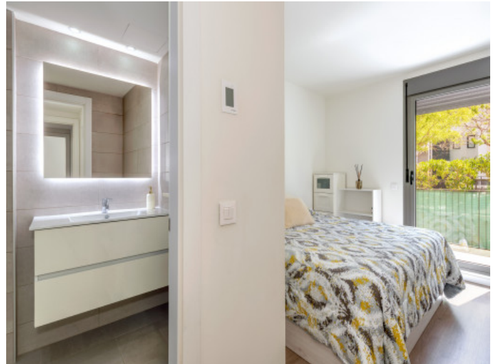
Bedroom in suite