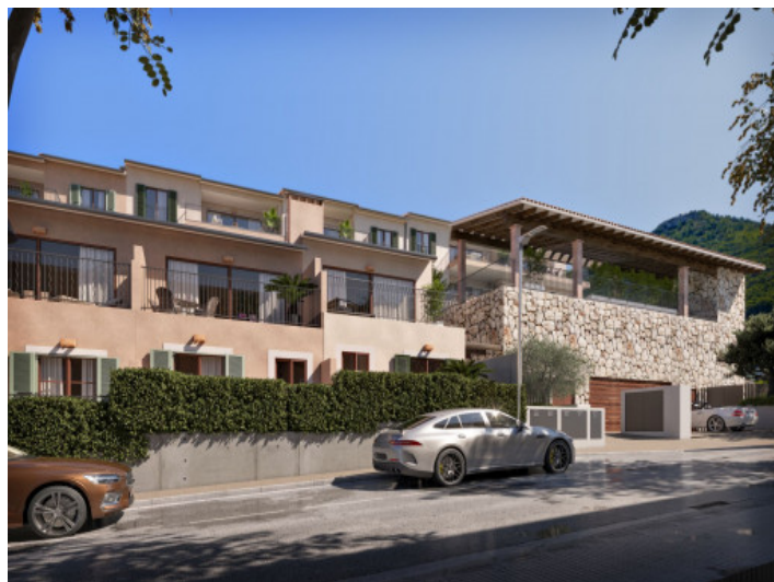
Entrance of community