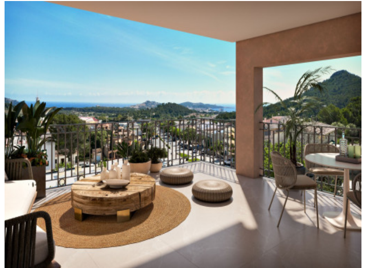
Terrace with sea view