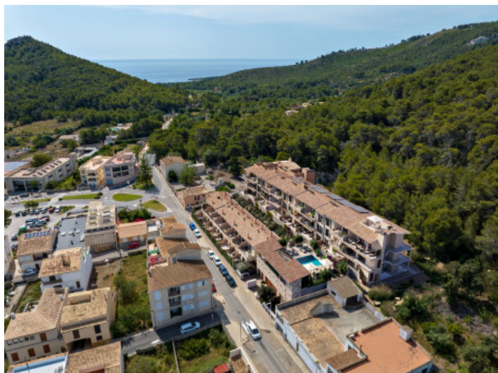
Location of community