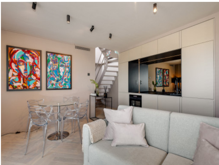
Alternative living room