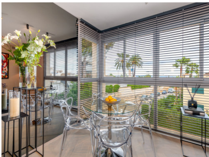
Dining area with a view