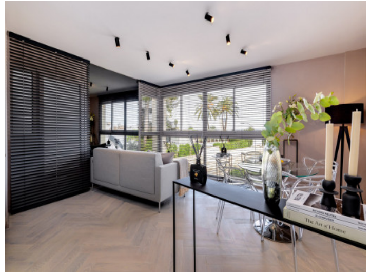
Alternative furniture layout