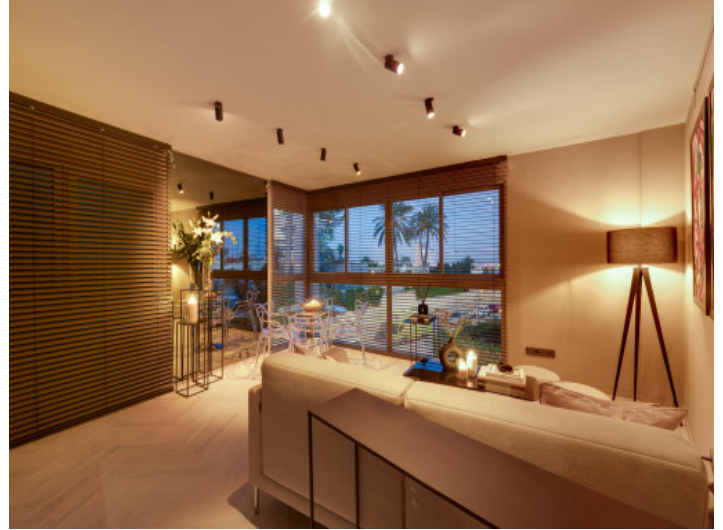
Dim-to-warm lighting concept