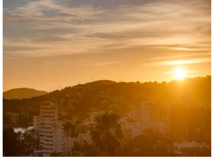
Golden hour terrace