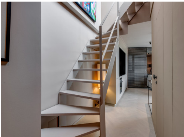
Access to rooftop terrace

All information is correct to the best of our knowledge. Errors and prior sale excepted. This prospectus is purely for information purposes. Only the notarized deed of sale is legally binding.