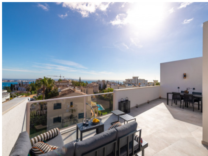
Panoramic terrace view