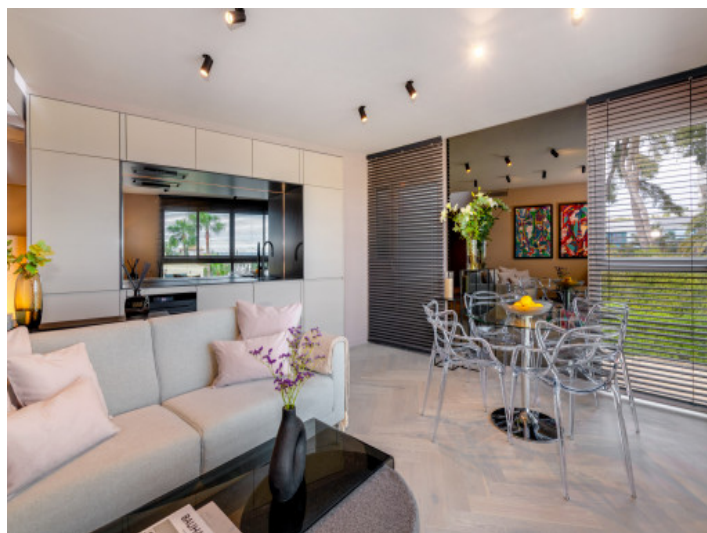
Open-plan living and dining area

All information is correct to the best of our knowledge. Errors and prior sale excepted. This prospectus is purely for information purposes. Only the notarized deed of sale is legally binding.