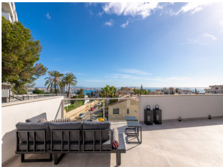
Sea view rooftop terrace