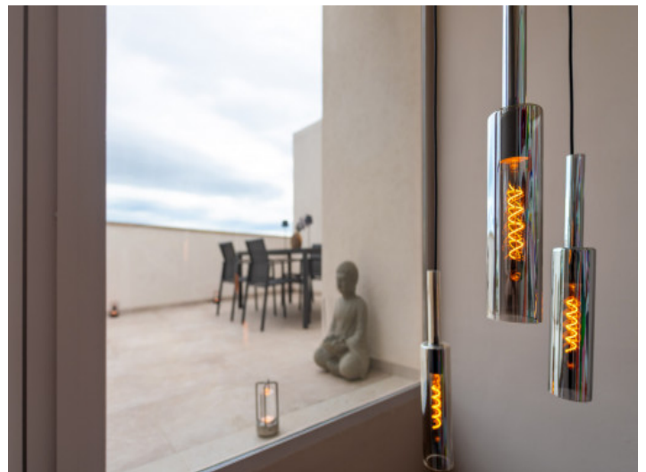
Access to the rooftop terrace

All information is correct to the best of our knowledge. Errors and prior sale excepted. This prospectus is purely for information purposes. Only the notarized deed of sale is legally binding.