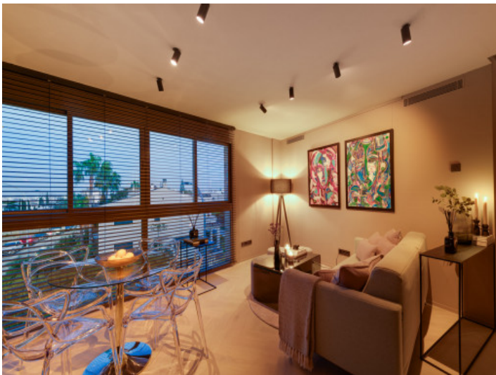
Living room evening atmosphere