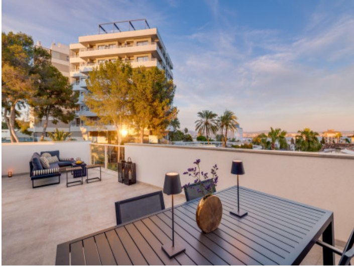
Rooftop terrace in the evening