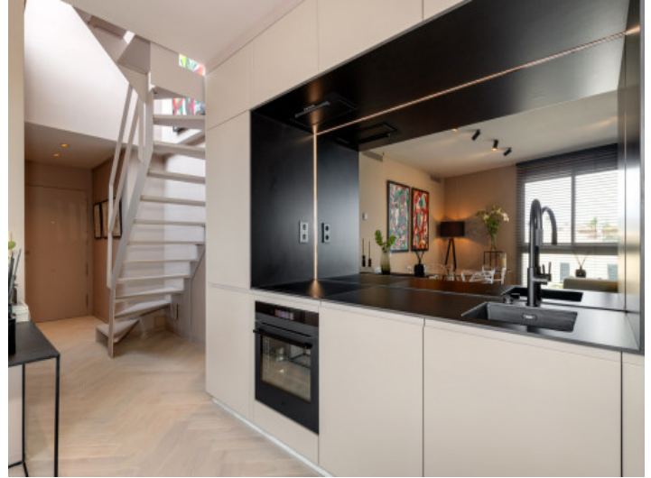
Kitchen and hallway