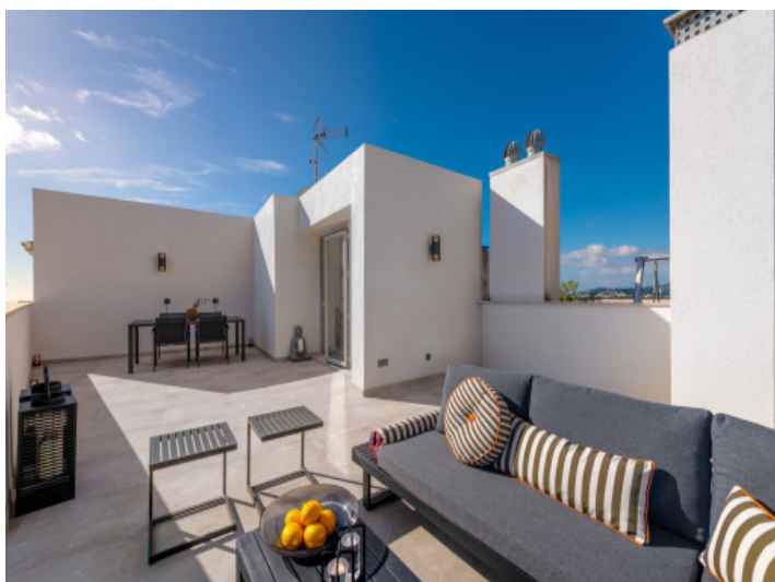
Sunny rooftop terrace