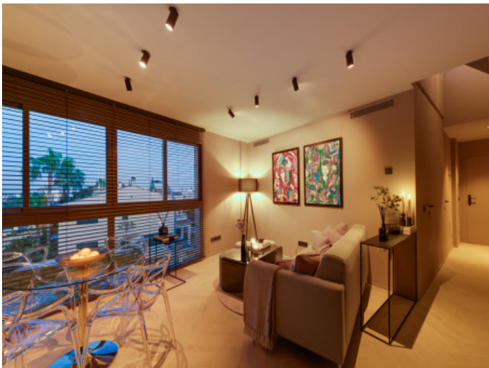
Evening lighting atmosphere