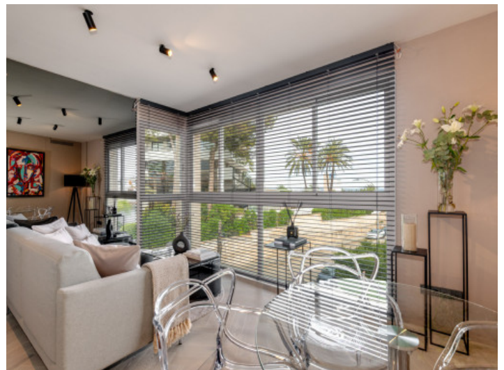
Sofa by the window

All information is correct to the best of our knowledge. Errors and prior sale excepted. This prospectus is purely for information purposes. Only the notarized deed of sale is legally binding.