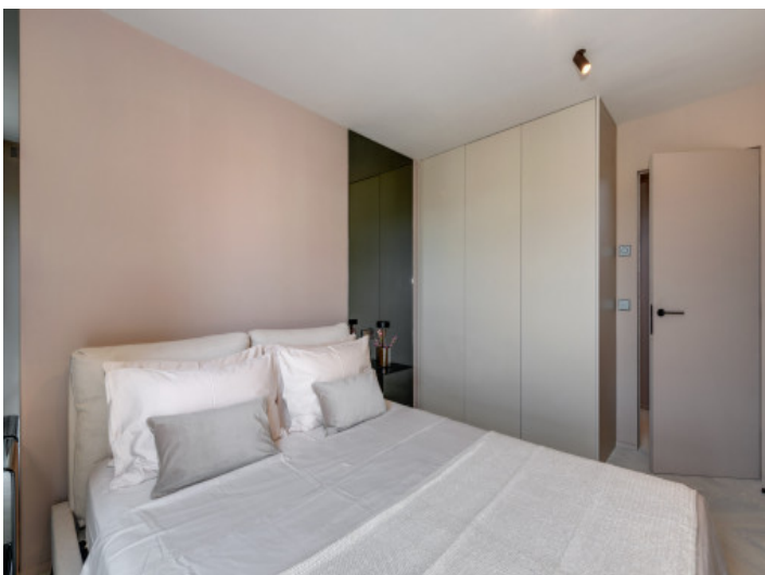
Built-in wardrobes in the bedroom