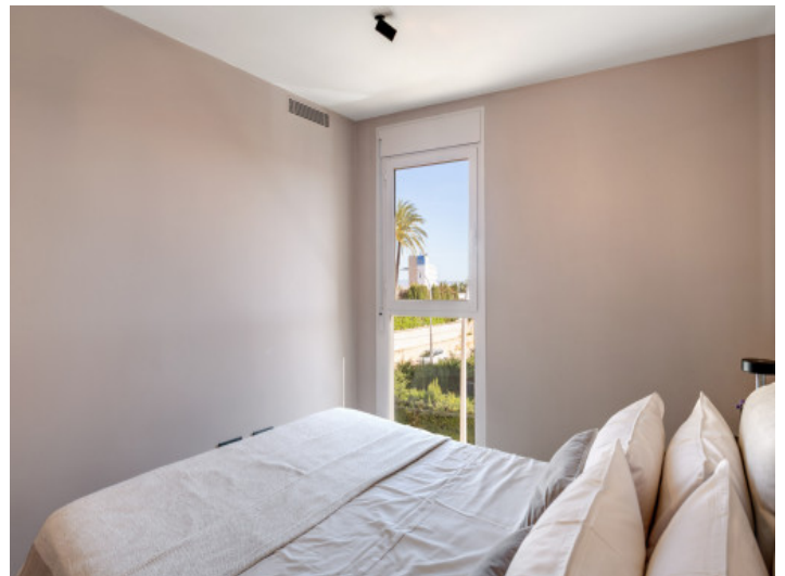
Bedroom with a view