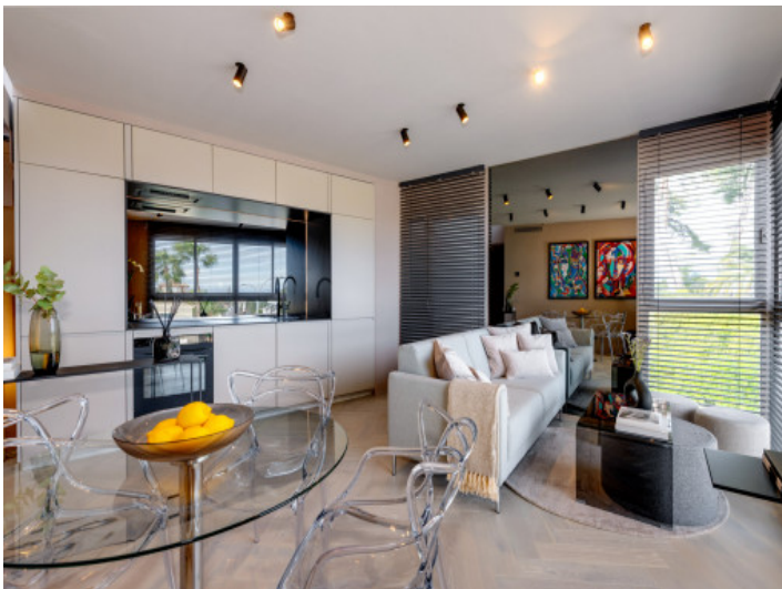
Alternative living room setup