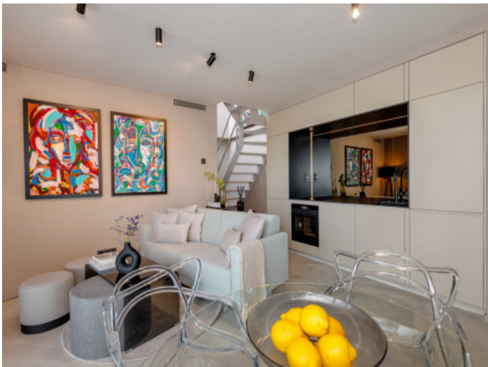
Light-filled living room