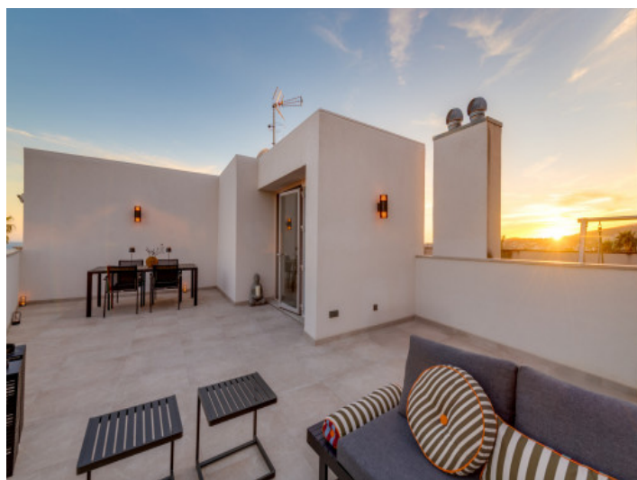
Sunset rooftop terrace