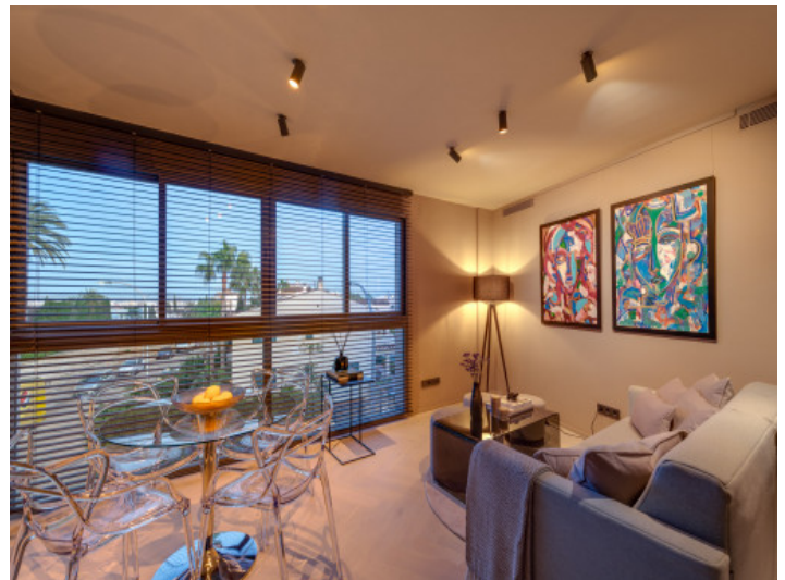
Cozy lighting concept