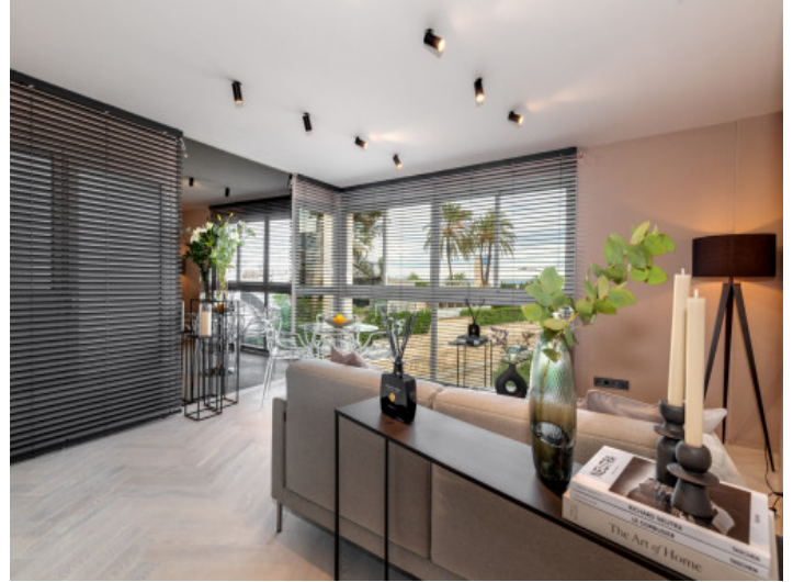
Living room with sea view