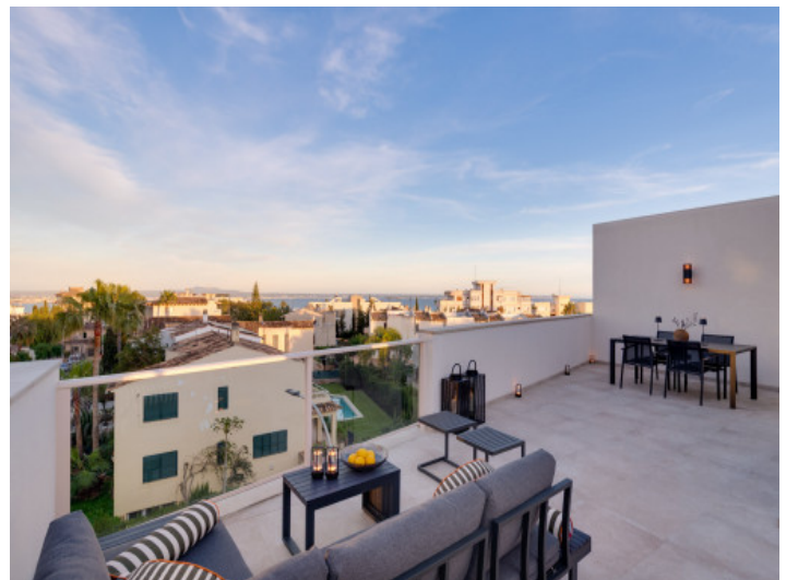
Evening atmosphere over Palma

All information is correct to the best of our knowledge. Errors and prior sale excepted. This prospectus is purely for information purposes. Only the notarized deed of sale is legally binding.