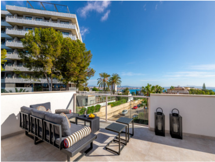
Sunny rooftop terrace