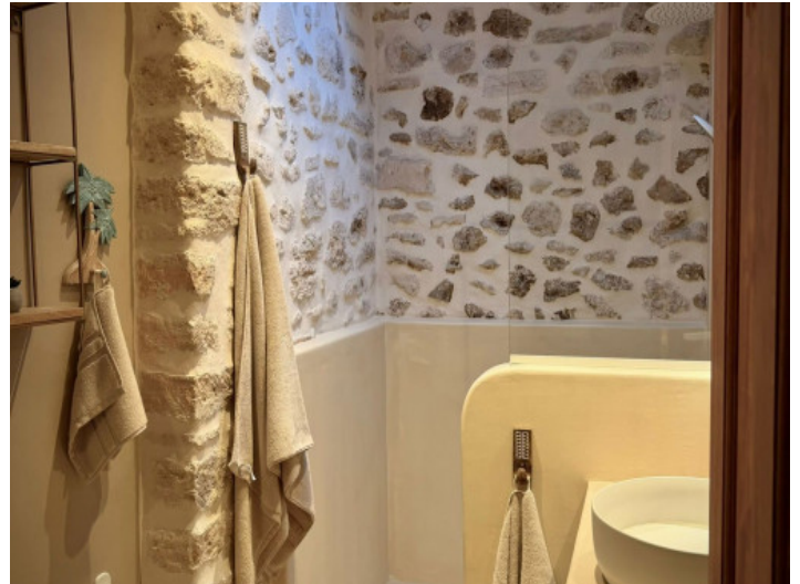
Bathroom with natural stone wall