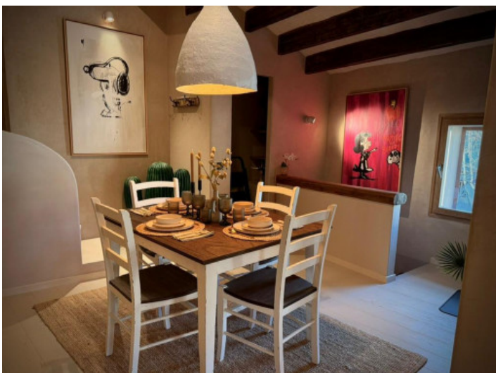
Dining and living area