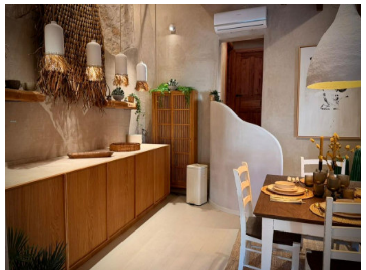
Open concept dining room.