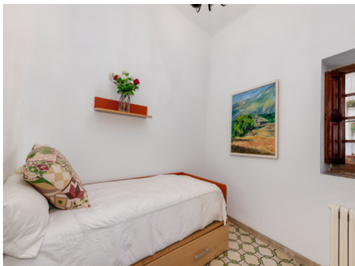
One of the 5 bedrooms