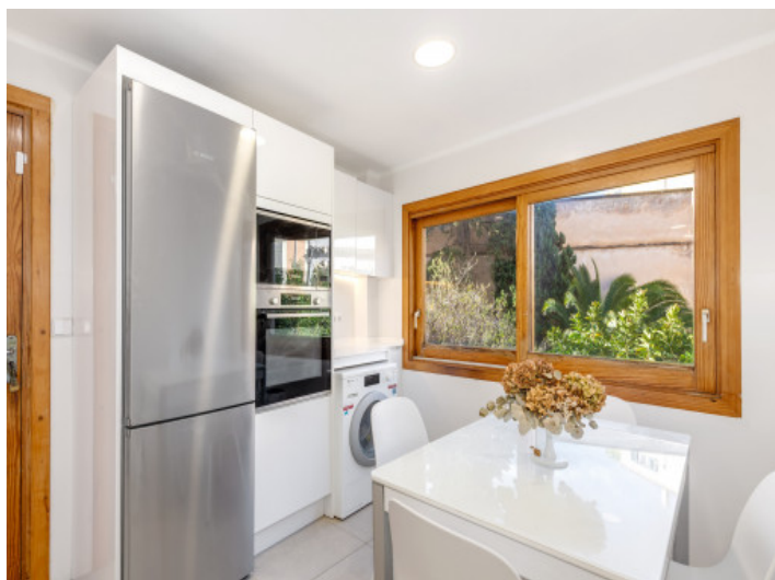
Kitchen dining area