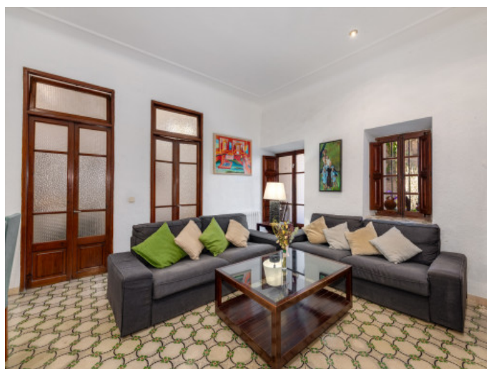
Comfortable living room

All information is correct to the best of our knowledge. Errors and prior sale excepted. This prospectus is purely for information purposes. Only the notarized deed of sale is legally binding.