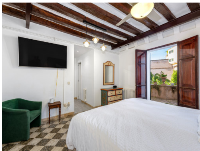
Bedroom in suite