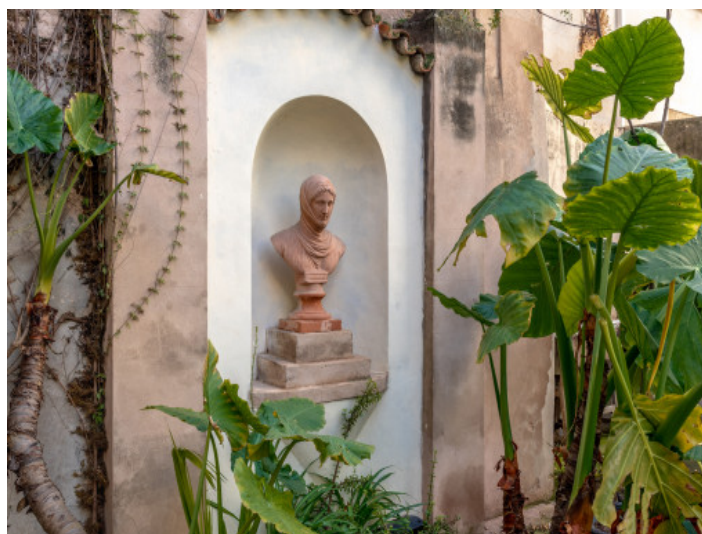
Details of the garden