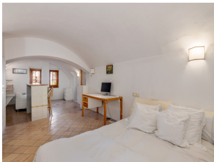
Separated guest studio