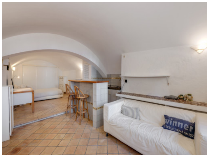
Cozy guest studio