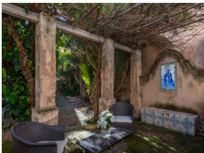
Corner in the garden