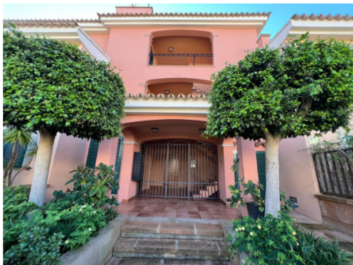
Entrance of the building