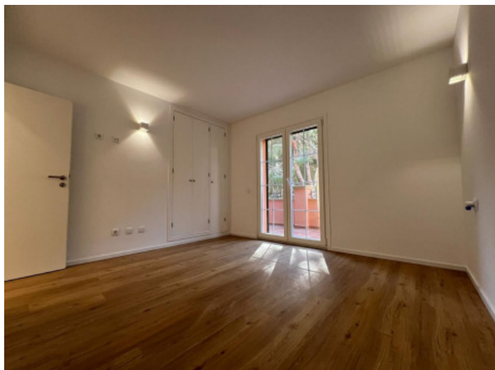
Bright room with access to the terrace