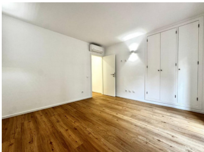
Bedroom with built in wardrobe and terrace access