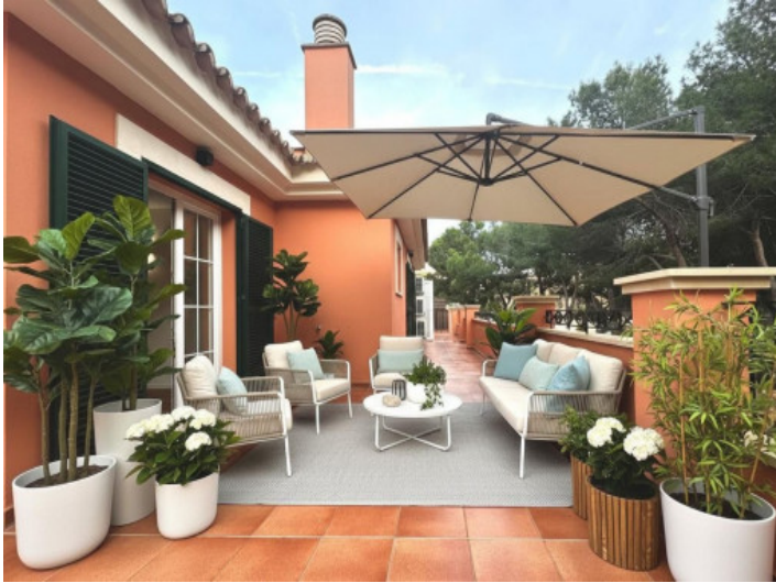
Rendered cosy terrace