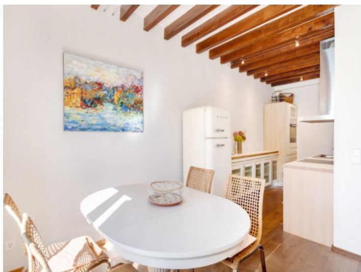
Dining area adjoining the kitchen