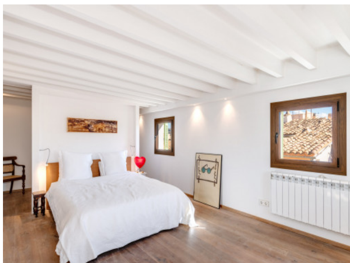
Master bedroom with dressing area