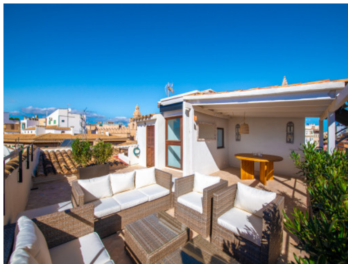
Rooftop terrace with covered area