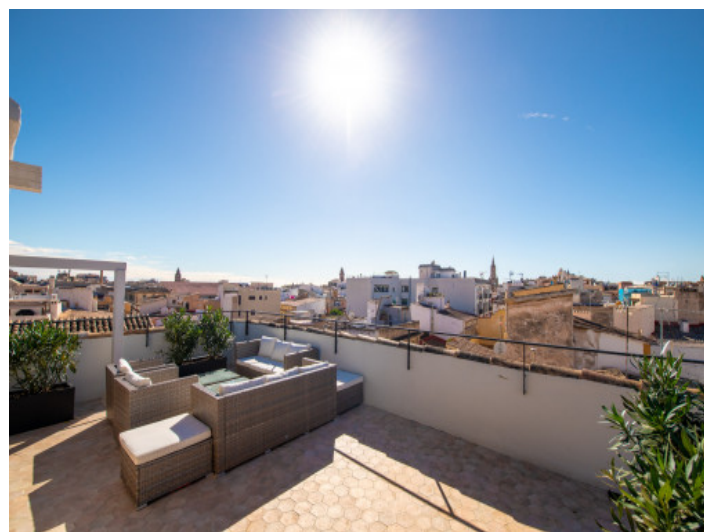
Sunny rooftop terrace