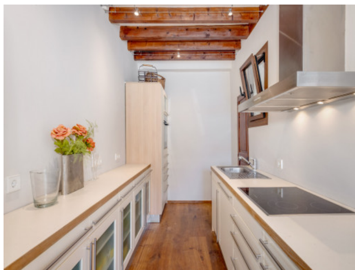
Fitted kitchen with adjoining pantry