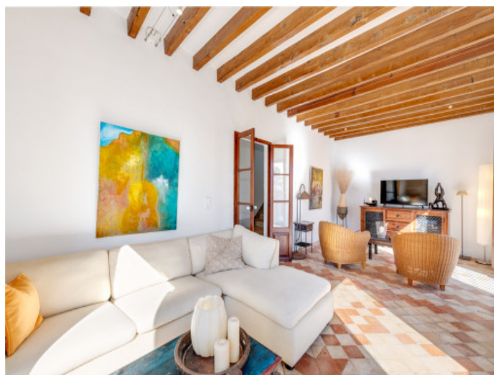
Spacious living room