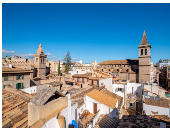
View over the old town rooftops