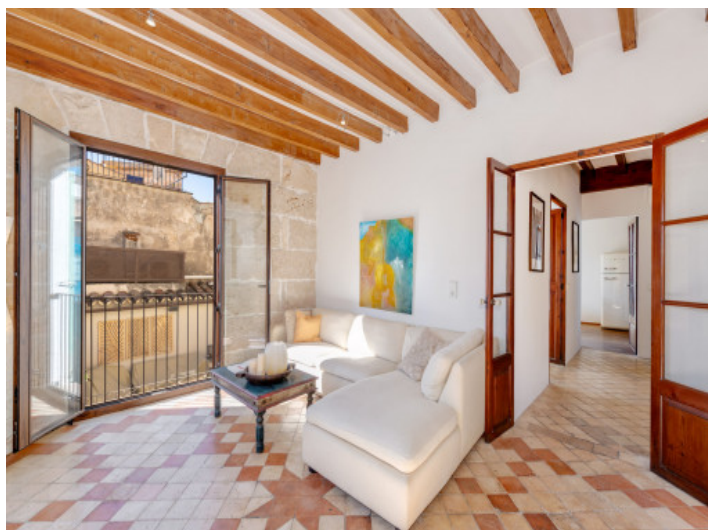
Cozy seating area