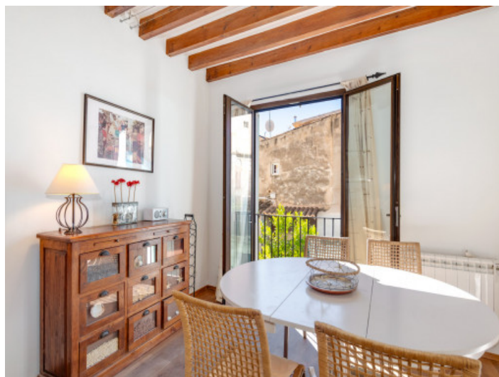
Bright, light-flooded dining room

All information is correct to the best of our knowledge. Errors and prior sale excepted. This prospectus is purely for information purposes. Only the notarized deed of sale is legally binding.