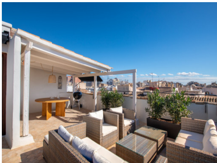
Private rooftop terrace