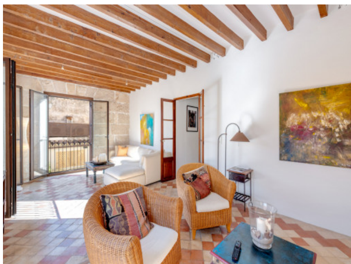
Bright living room with original ceiling beams