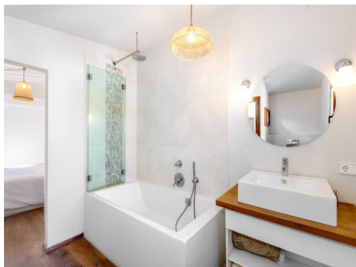
Another en-suite bathroom