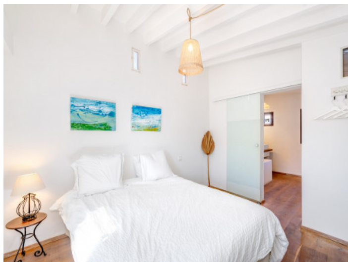
Second of three bedrooms

All information is correct to the best of our knowledge. Errors and prior sale excepted. This prospectus is purely for information purposes. Only the notarized deed of sale is legally binding.