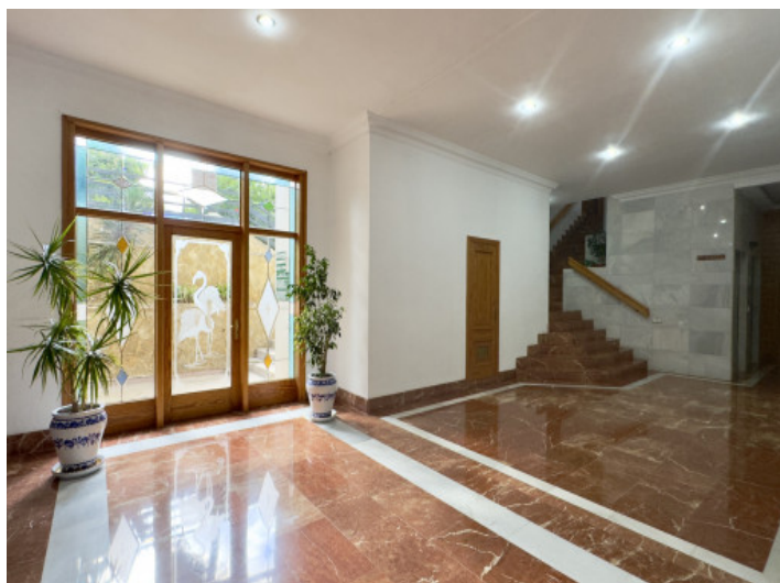
Way to the Pool

All information is correct to the best of our knowledge. Errors and prior sale excepted. This prospectus is purely for information purposes. Only the notarized deed of sale is legally binding.