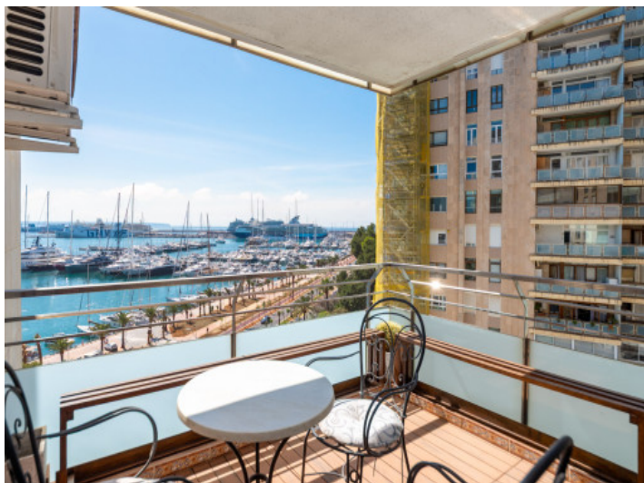
Apartment with the view of the harbour in Palma