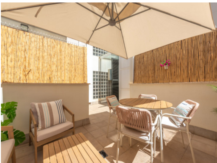
Private sun terrace