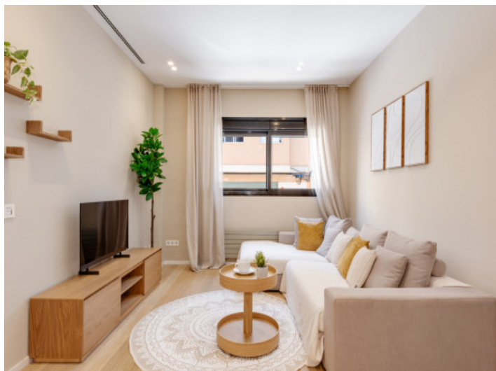
Bright, inviting living room