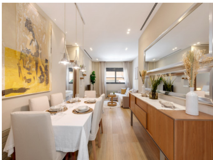
Open-plan living and dining room