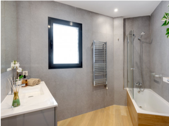
Bathroom with shower tub and towel warmer