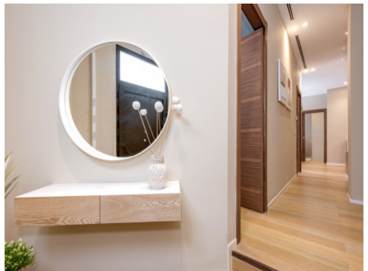
Welcoming entrance area