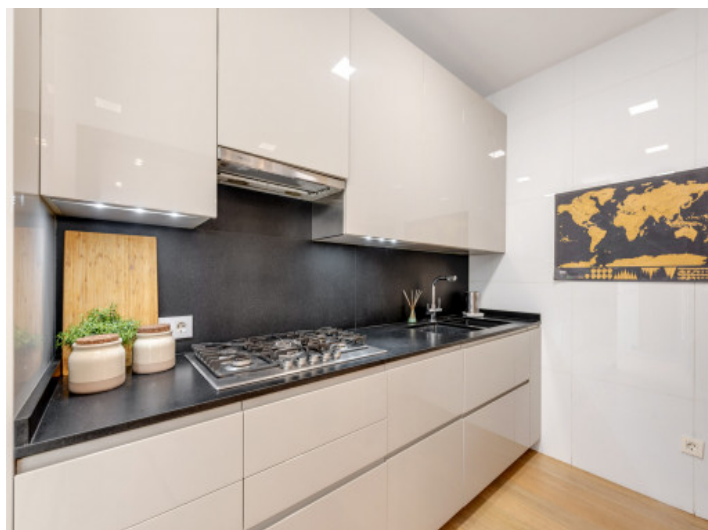
Fully equipped fitted kitchen