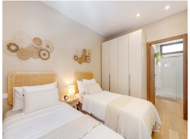
Second bedroom with built-in wardrobes