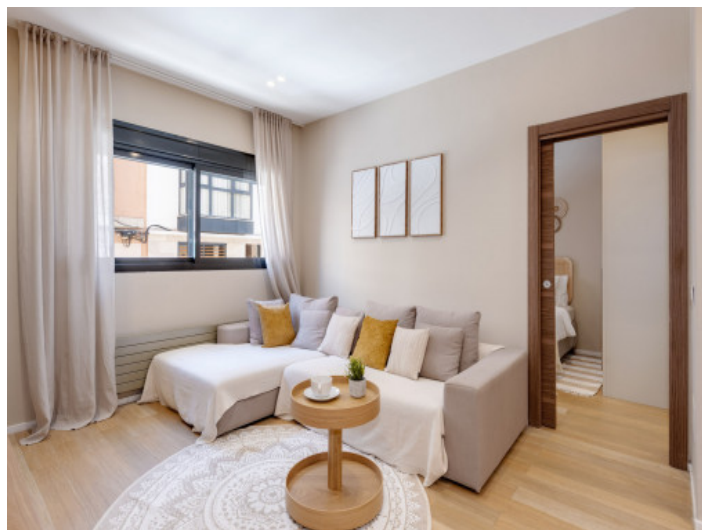
Cozy seating area