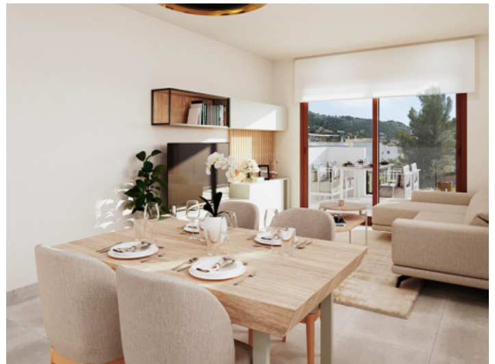
Living and Dining