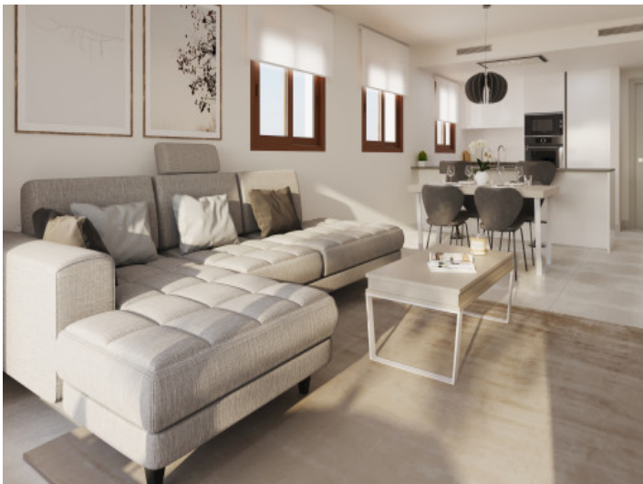
Living room and Kitchen