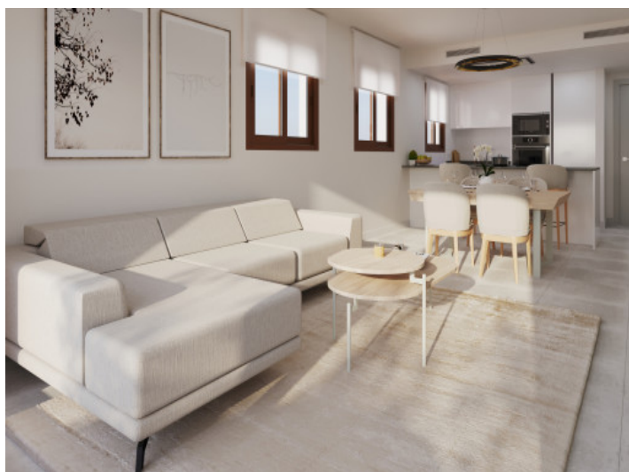
Living room and Kitchen