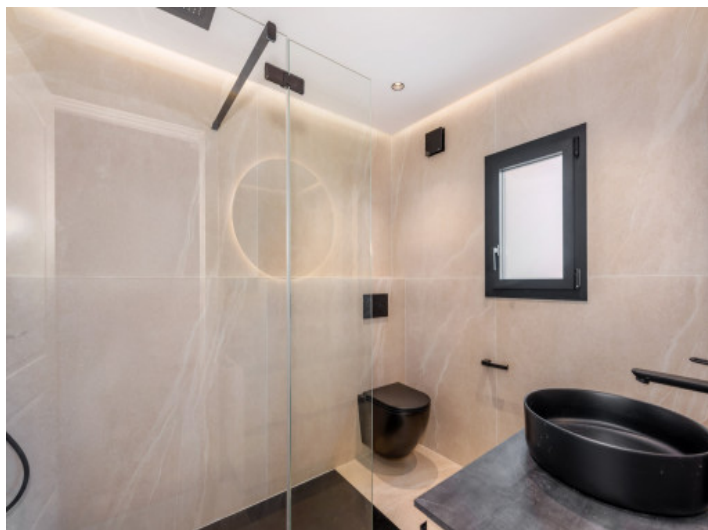
Stylish master bathroom