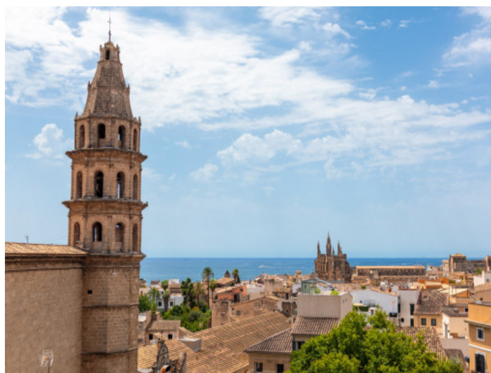
View over the cathedral and the sea