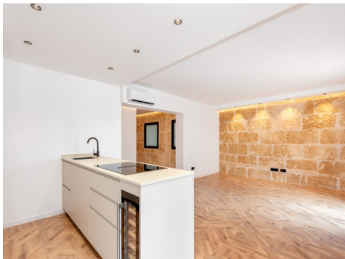
Open view from the kitchen to the beautiful Marès stone wall