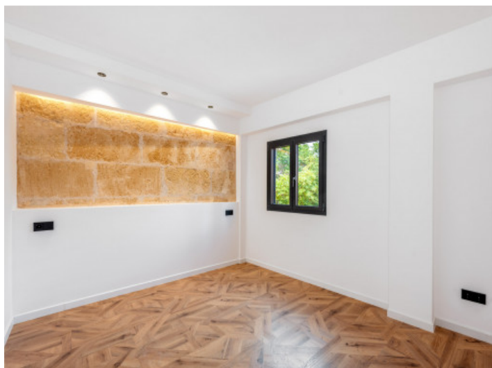
Master bedroom with private dressing area