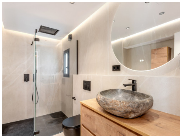
Second guest bathroom