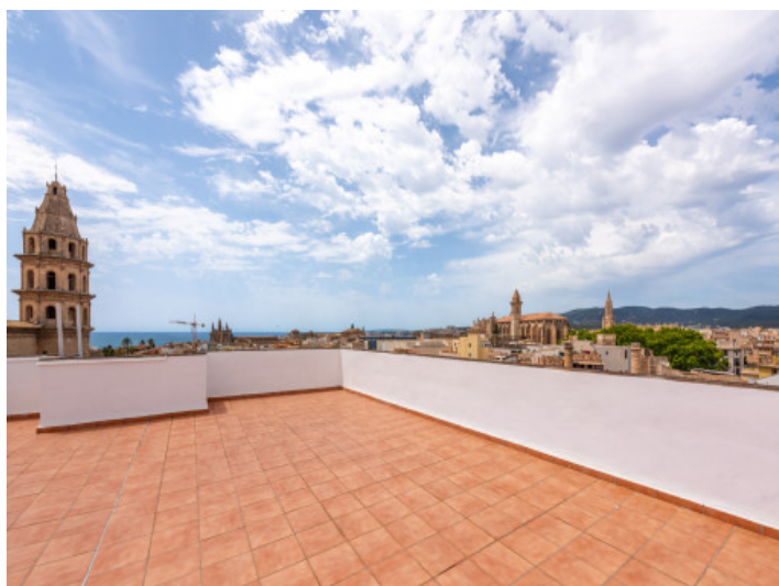
Shared terrace with incredible panoramic views