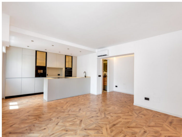
Spacious and bright living/dining area