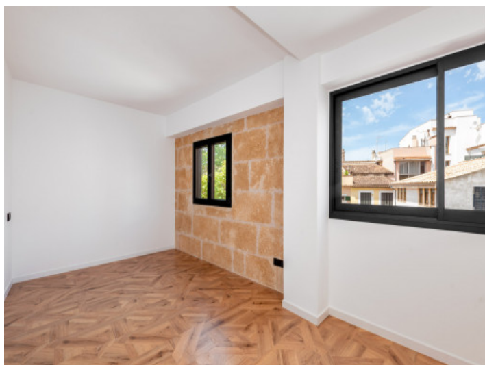
One of the two bedrooms with large windows