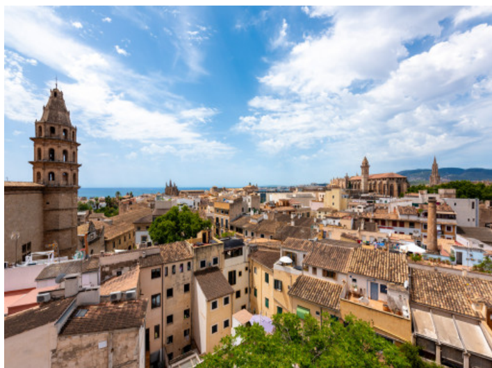
View over the rooftops of Palma's old town