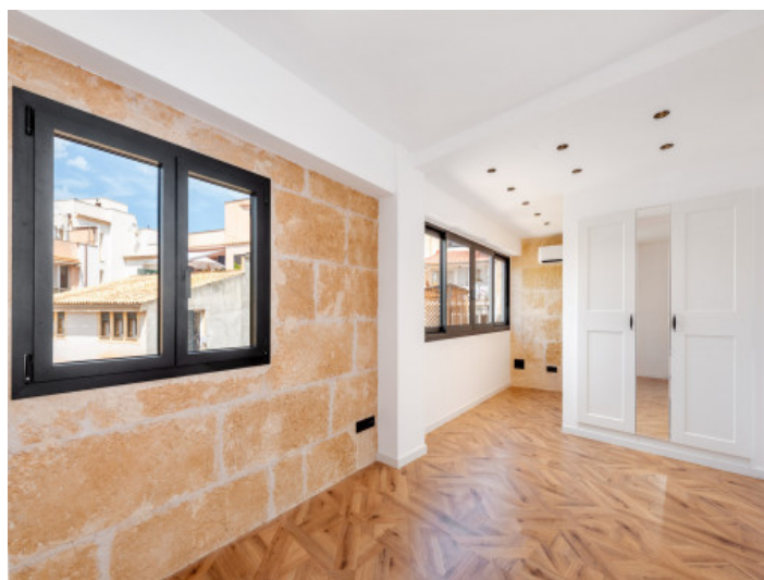
Built-in wardrobes and a work corner in one of the bedrooms