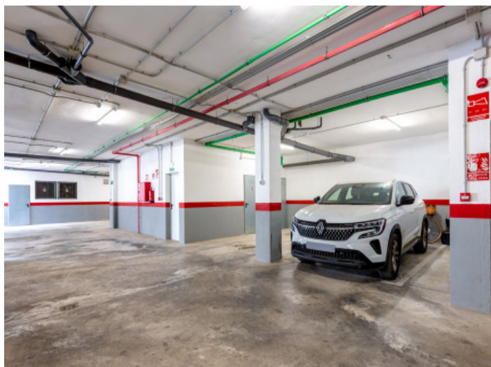
Underground parking space