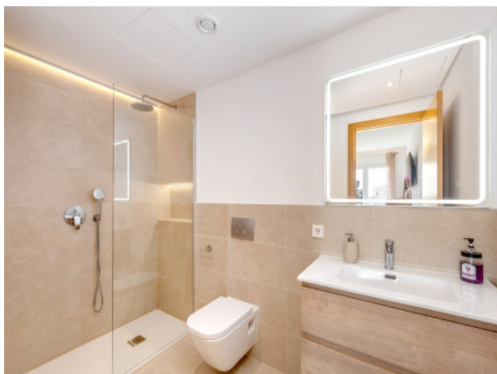
Bathroom in Suite