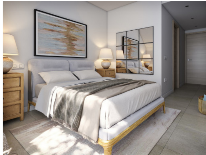
One of the three bedrooms