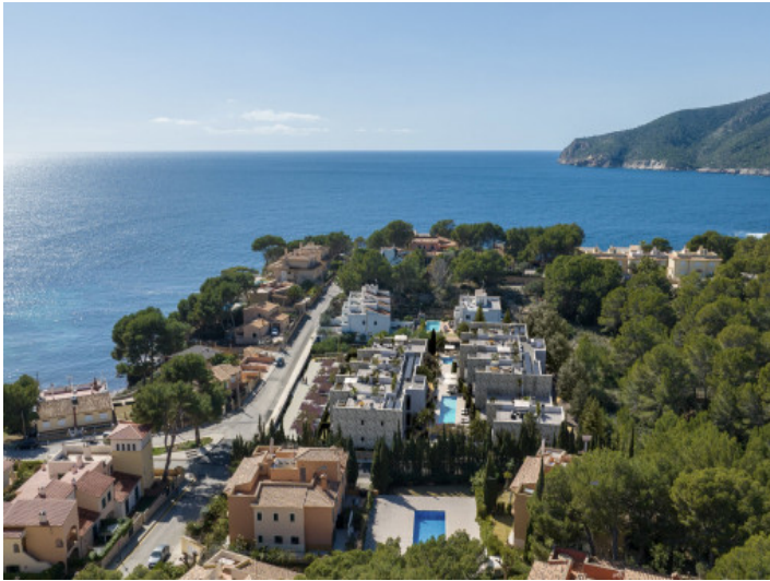
View over the complex