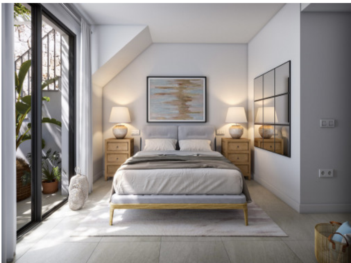
Master bedroom with garden access