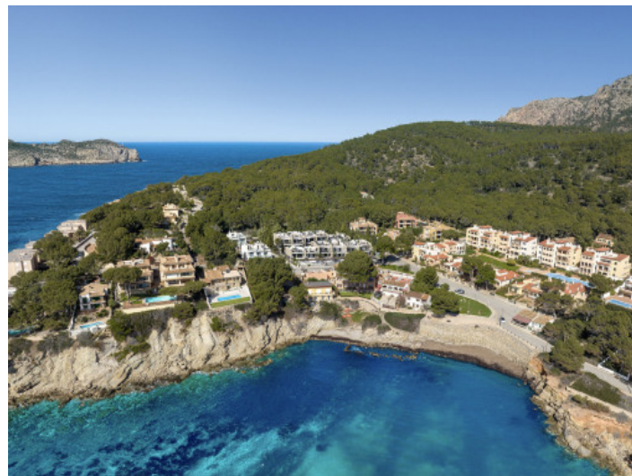
Close to the beach

All information is correct to the best of our knowledge. Errors and prior sale excepted. This prospectus is purely for information purposes. Only the notarized deed of sale is legally binding.