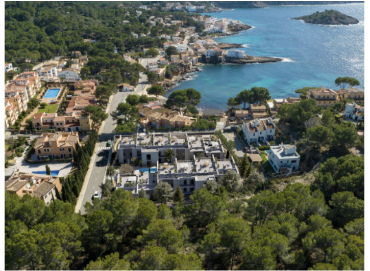
Community near the sea