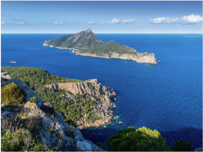
The nature of dragonera