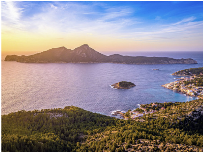
Dragonera at sunset