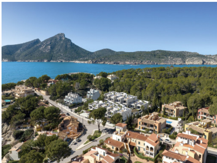
The complex in front of dragonera