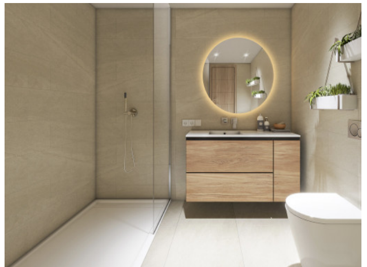
Bathroom with large shower

All information is correct to the best of our knowledge. Errors and prior sale excepted. This prospectus is purely for information purposes. Only the notarized deed of sale is legally binding.