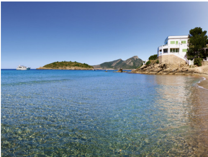
Beach within walking distance