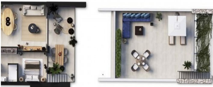
Penthouse floor plan