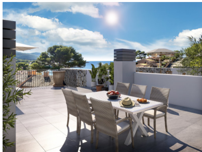
Sea view rooftop terrace