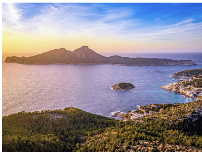
Dragonera at sunset