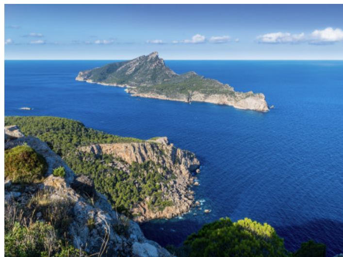
The nature of dragonera

All information is correct to the best of our knowledge. Errors and prior sale excepted. This prospectus is purely for information purposes. Only the notarized deed of sale is legally binding.