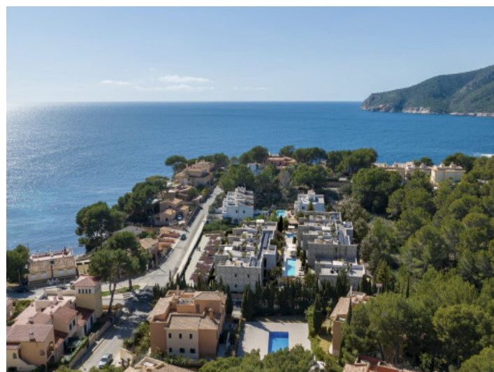
View over the complex