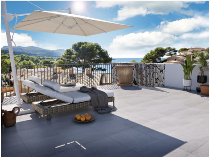
Lounge area with view