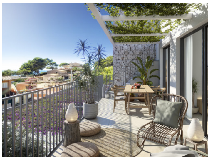
Balcony on main living level