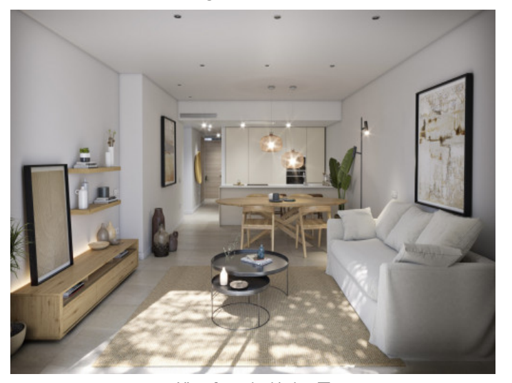
View from the kitchen \boxtimes