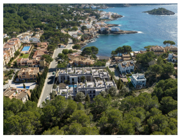
Community near the sea lacktriangle