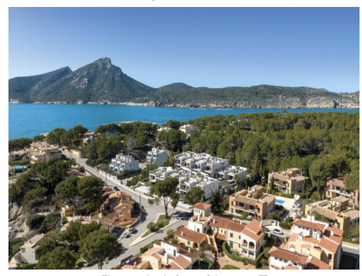
The complex in front of dragonera ■