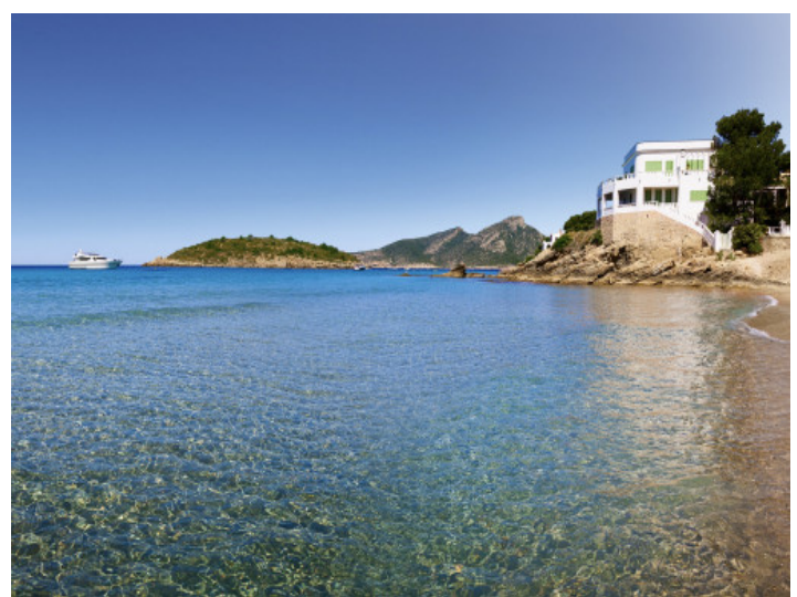
Beach within walking distance