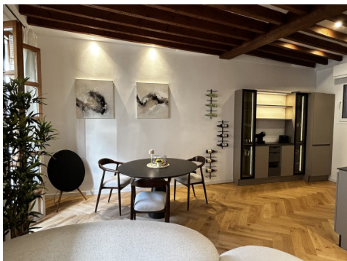
Dining area / Kitchen