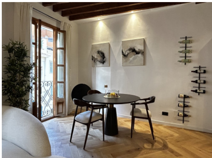
Bright, light-filled dining area