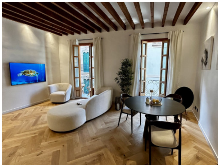
Cozy living and dining area