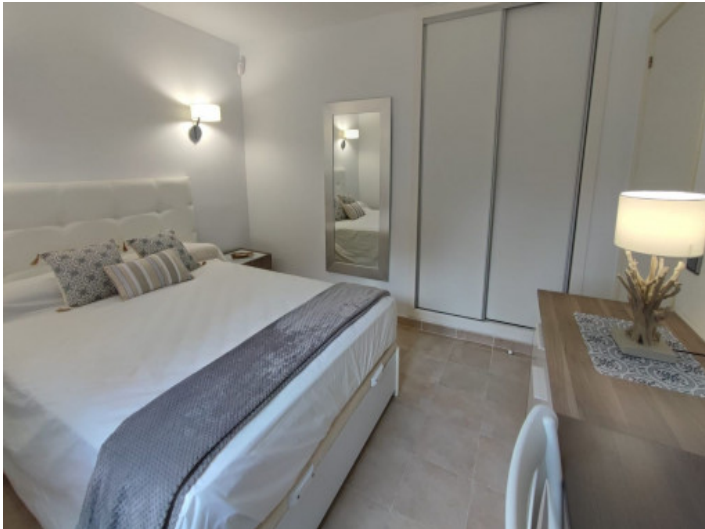
Bright bedroom with generous storage