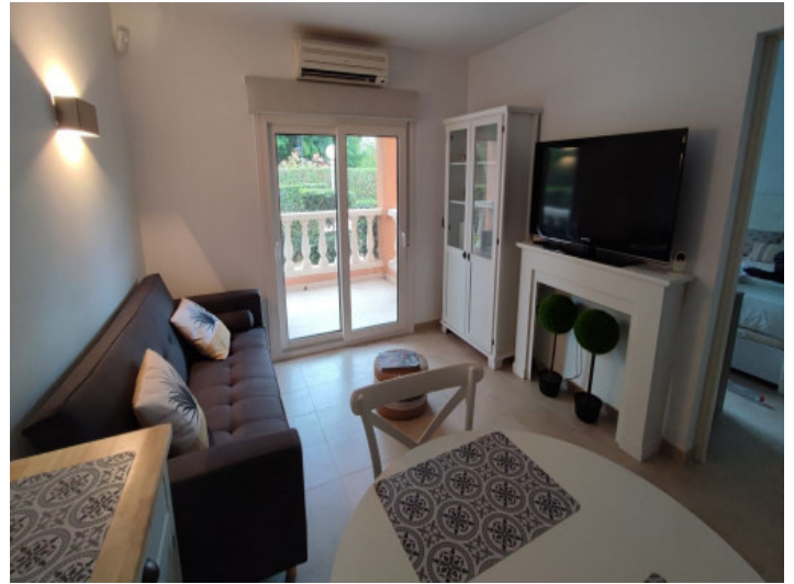
Living room with access to the covered terrace and garden