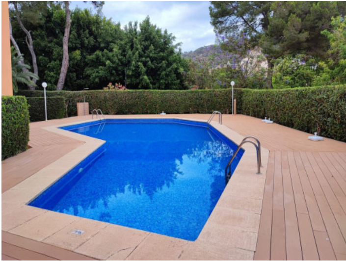
Inviting pool area surrounded by greenery and Mediterranean plants