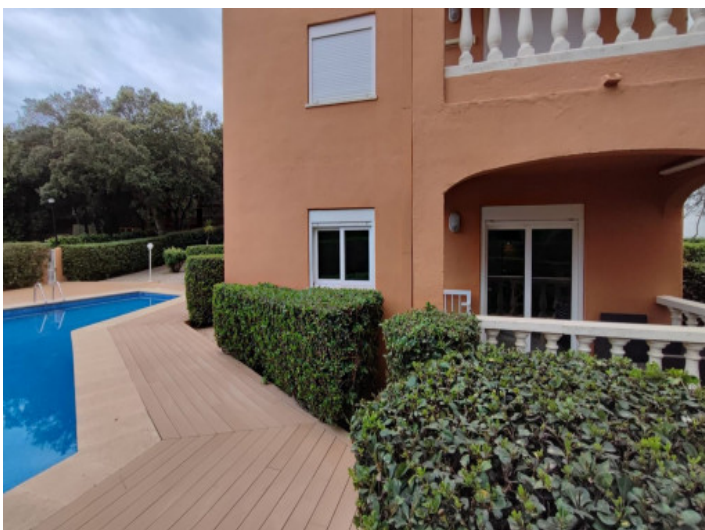
Well maintained residential complex with shared pool

All information is correct to the best of our knowledge. Errors and prior sale excepted. This prospectus is purely for information purposes. Only the notarized deed of sale is legally binding.