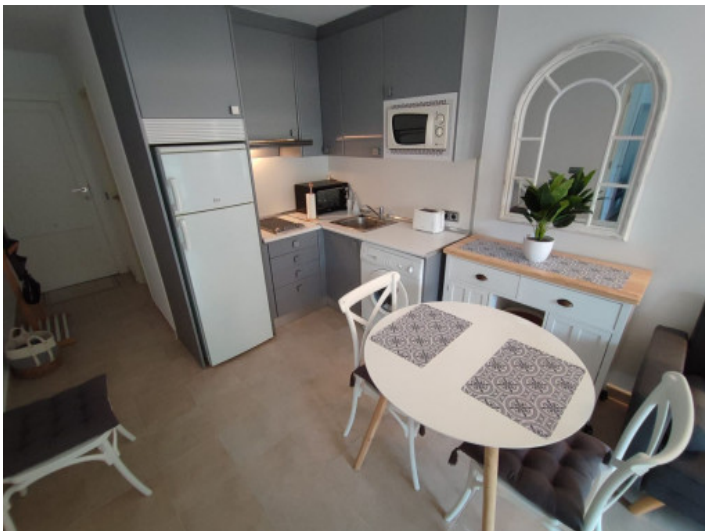
Fully equipped kitchen with dining area for everyday comfort