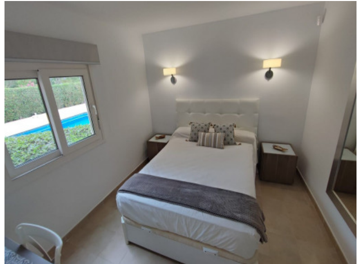
Bright bedroom with garden and pool views