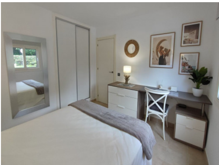
Bedroom with working area