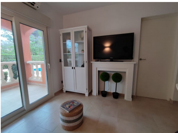
Living room with access to the covered terrace and garden