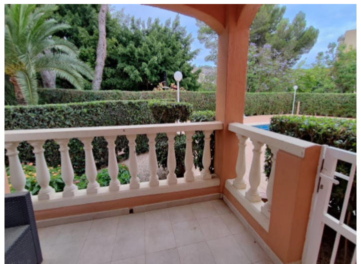
Private terrace with access to the pool

All information is correct to the best of our knowledge. Errors and prior sale excepted. This prospectus is purely for information purposes. Only the notarized deed of sale is legally binding.