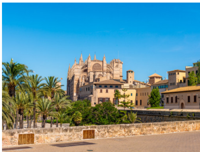
Central location right next to the cathedral