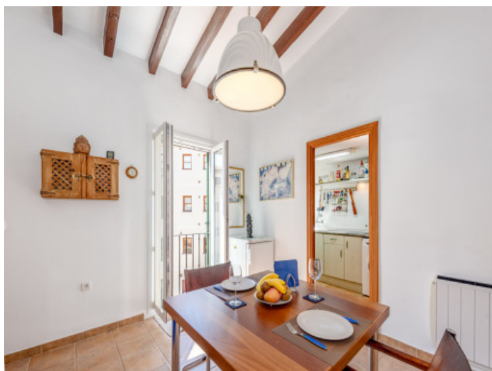
Dining room with view of the courtyard