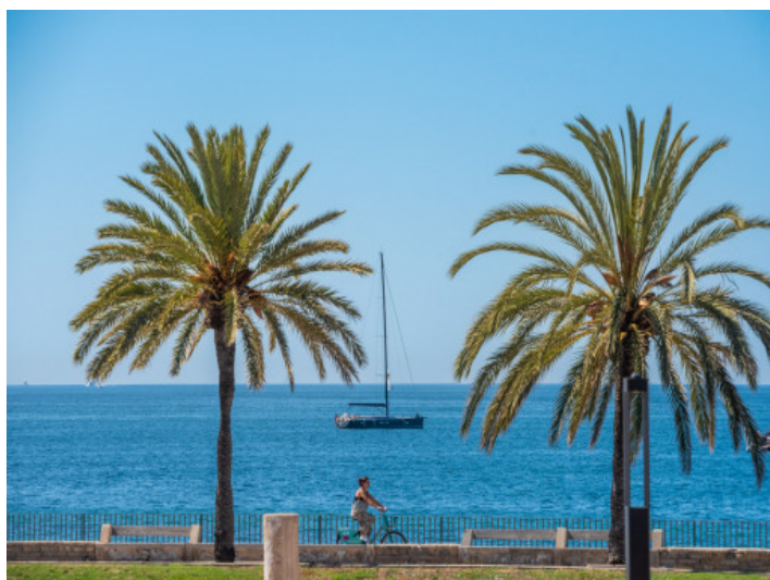
Walking distance to the sea