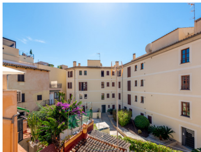
View of the charming courtyard