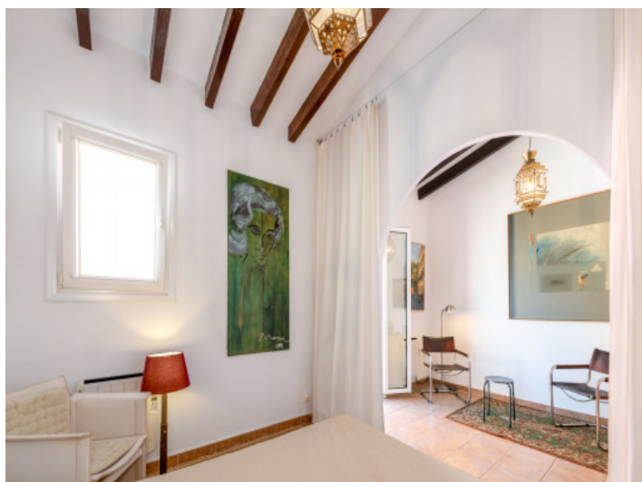
View from the bed