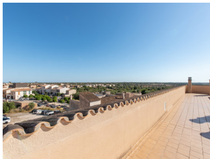
Community rooftop terrace