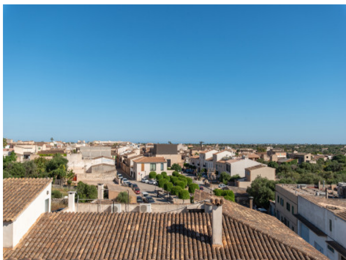
Far reaching views