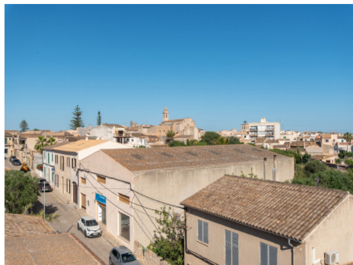
View to the church

All information is correct to the best of our knowledge. Errors and prior sale excepted. This prospectus is purely for information purposes. Only the notarized deed of sale is legally binding.