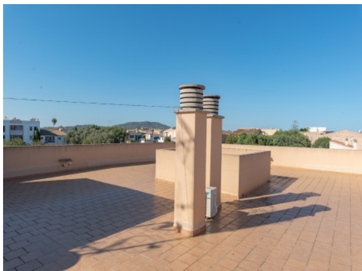
Big community rooftop terrace