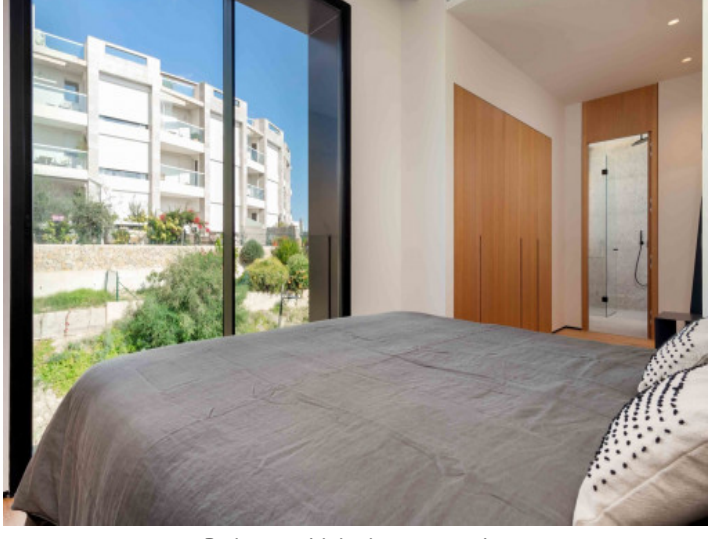
Bedroom with bathroom en suite

All information is correct to the best of our knowledge. Errors and prior sale excepted. This prospectus is purely for information purposes. Only the notarized deed of sale is legally binding.