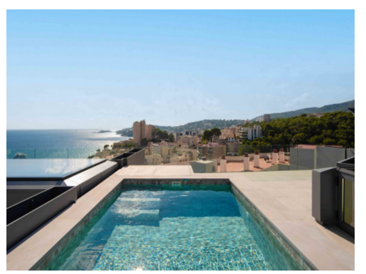
Rooftop with pool