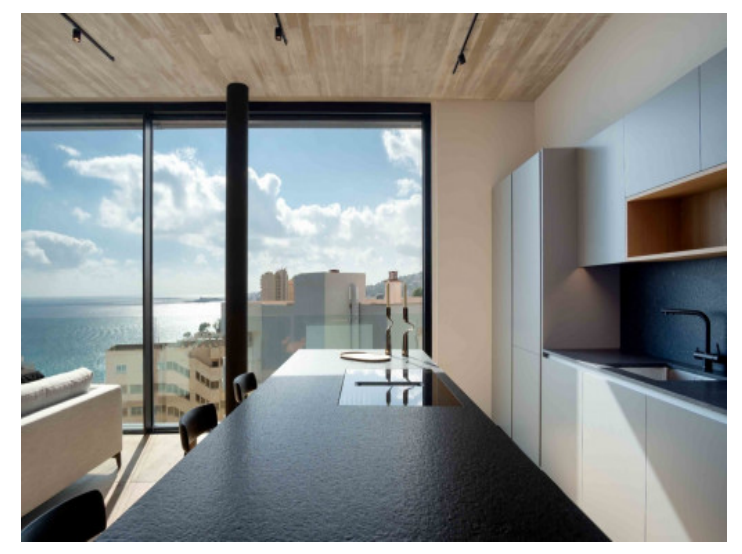
Views from the kitchen