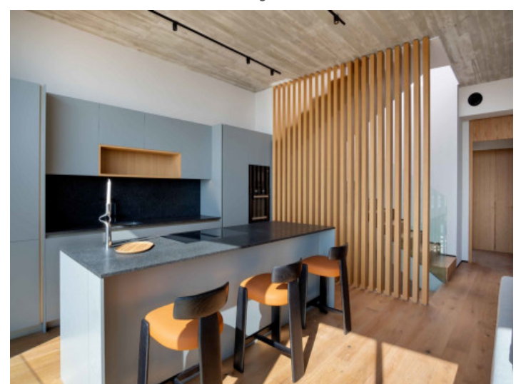
Large kitchen island