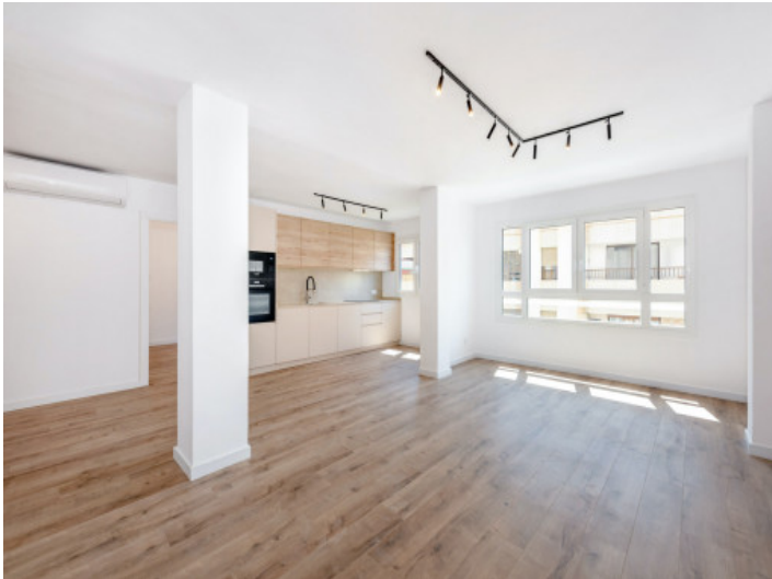
Living and dining area)