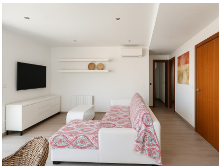
Living area and hall