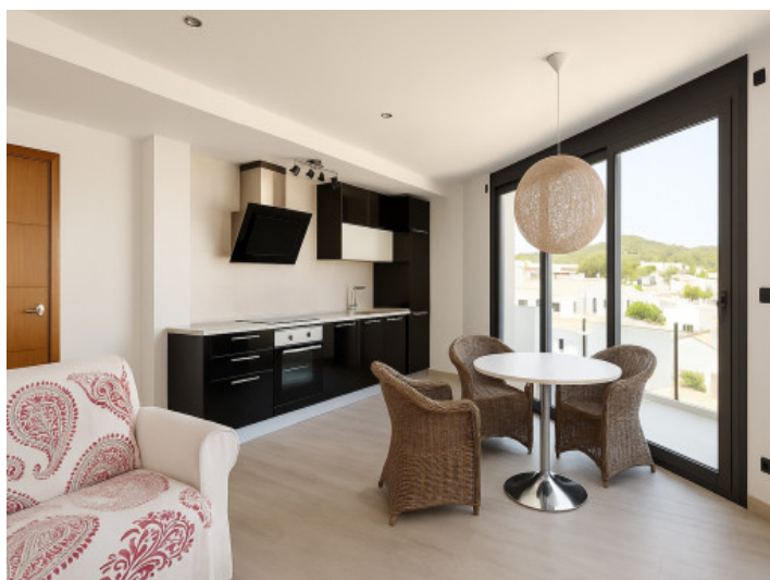
Kitchen with dining area and balcony