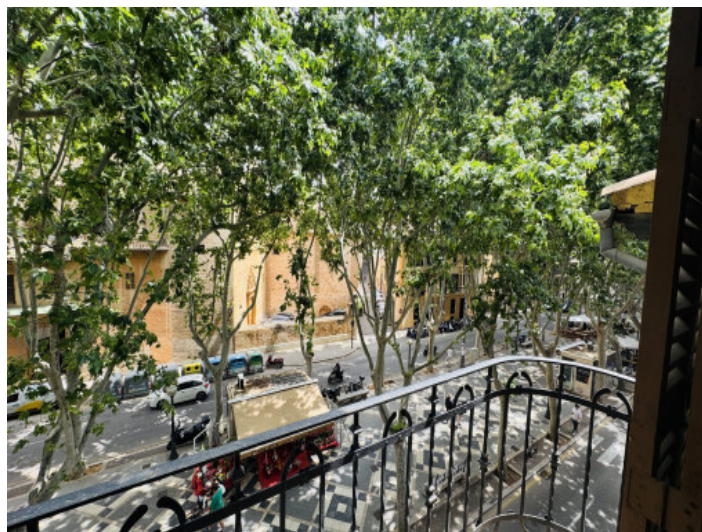
Balcony with a view of the Rambla