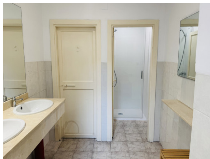
One of the two bathrooms