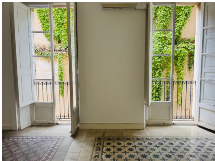
View from the living-dining area