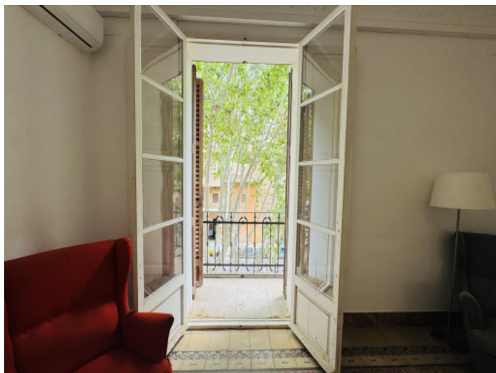
View from the balcony overlooking the Rambla