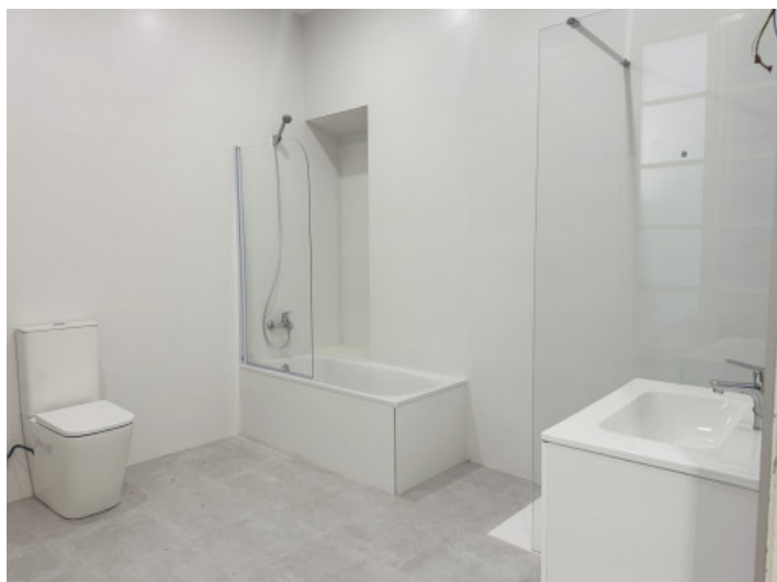
One of the 2 bathrooms