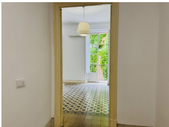
One of the four bedrooms