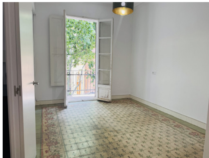
One of the four bedrooms