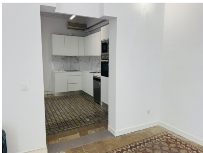
View from the living area into the kitchen