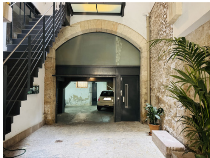
Entrance area with access to the garage

All information is correct to the best of our knowledge. Errors and prior sale excepted. This prospectus is purely for information purposes. Only the notarized deed of sale is legally binding.