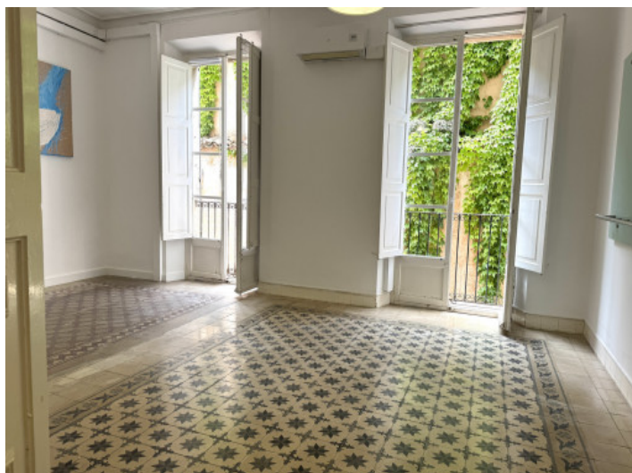
Second living room