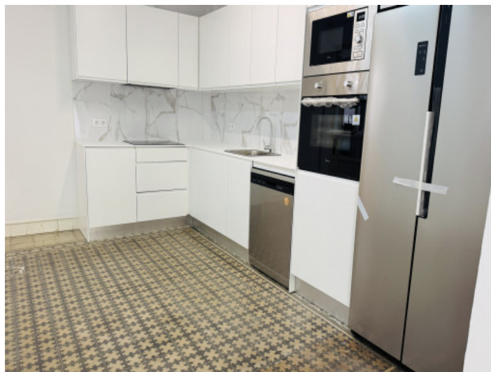
Fully equipped new kitchen