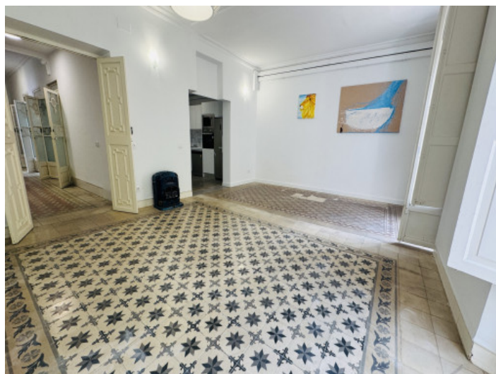
Second living-dining area

All information is correct to the best of our knowledge. Errors and prior sale excepted. This prospectus is purely for information purposes. Only the notarized deed of sale is legally binding.