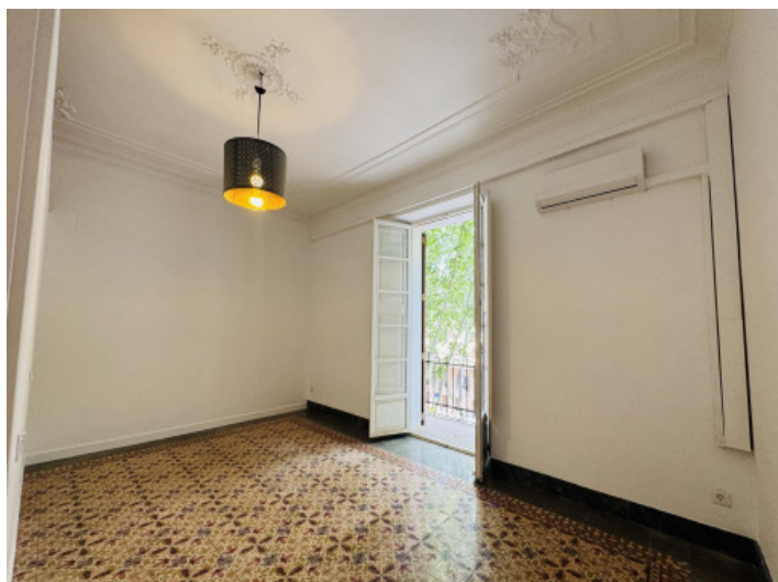
One of the four bedrooms