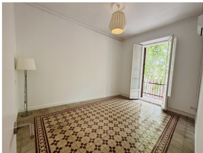
One of the four bedrooms

All information is correct to the best of our knowledge. Errors and prior sale excepted. This prospectus is purely for information purposes. Only the notarized deed of sale is legally binding.