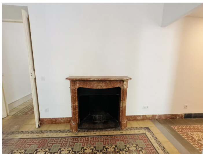
Fireplace in the living-dining area