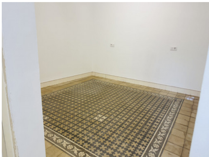
One of the four bedrooms