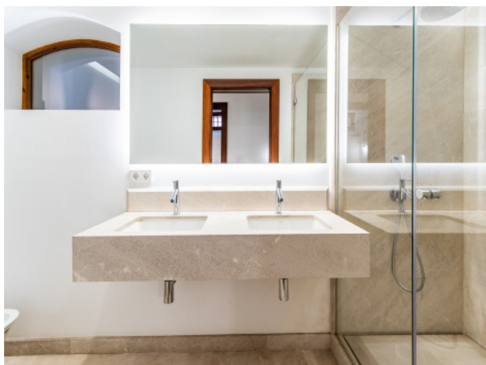
Another bathroom with shower