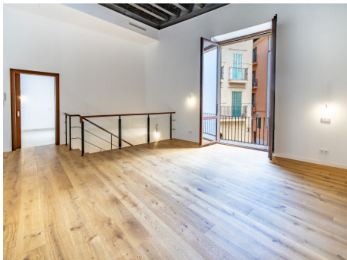
Living area with remarkable ceiling height