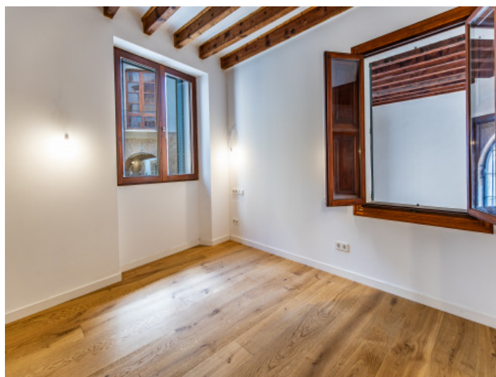
One of three bedrooms