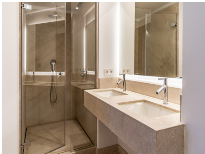
One of three bathrooms

All information is correct to the best of our knowledge. Errors and prior sale excepted. This prospectus is purely for information purposes. Only the notarized deed of sale is legally binding.