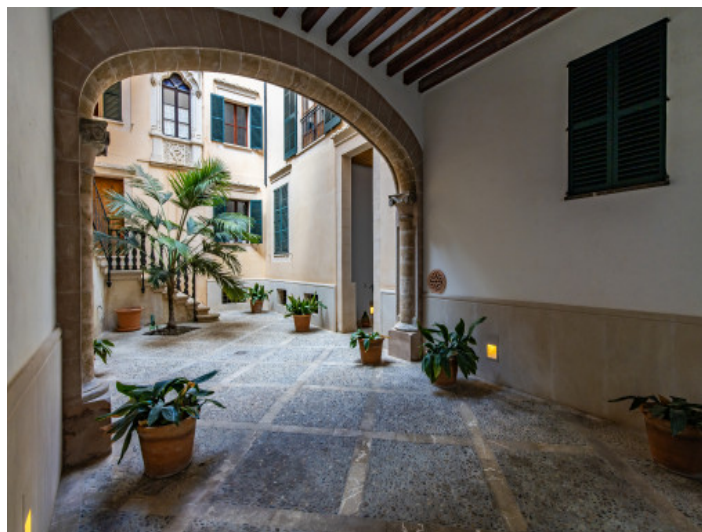
Historic old town palace