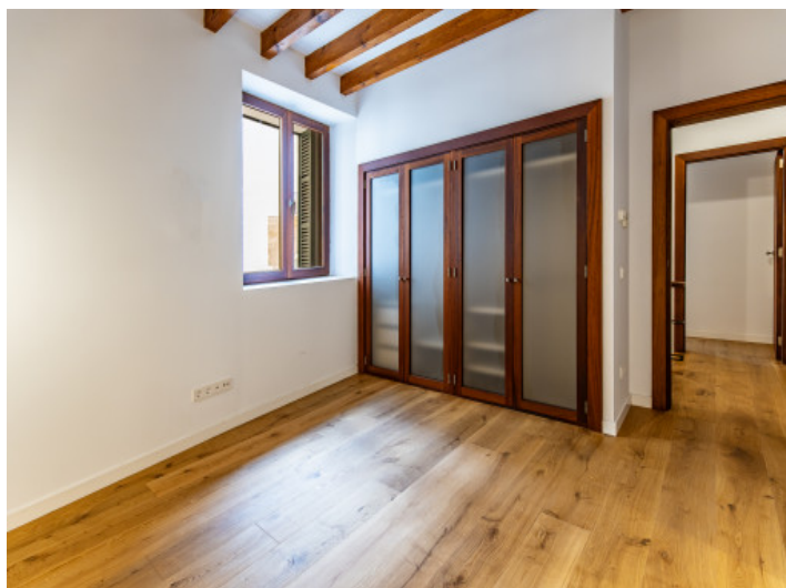
Additional bedroom with built-in wardrobes