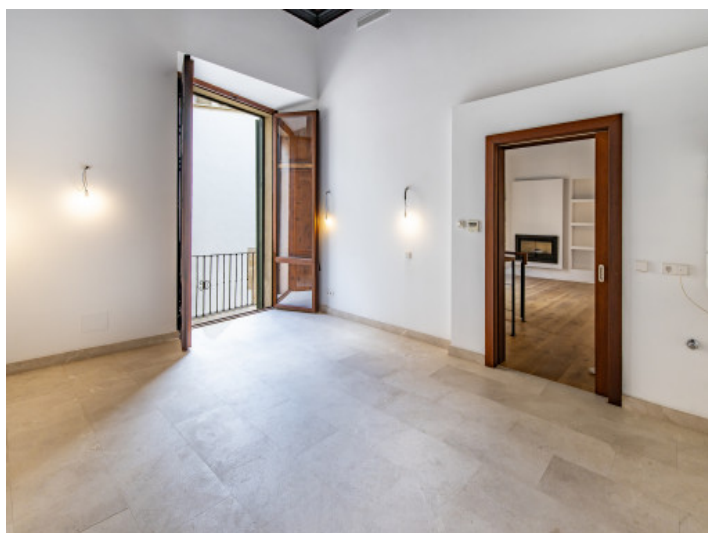
Individually customizable kitchen