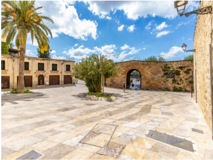
Excellent location at the cathedral