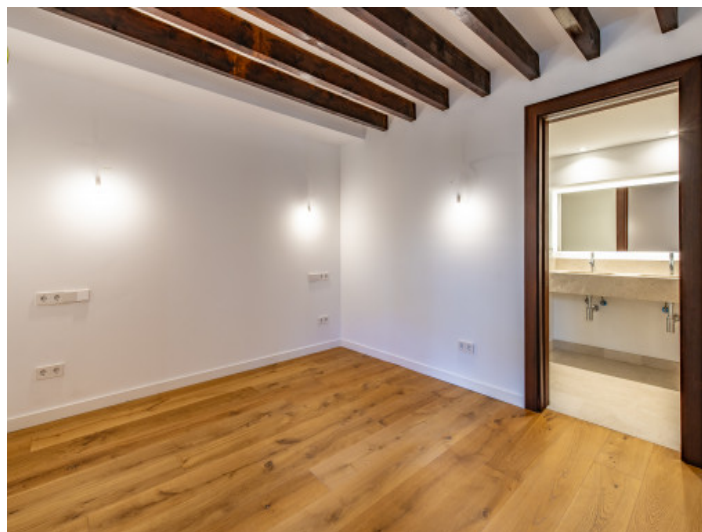
Master bedroom with an en suite bathroom