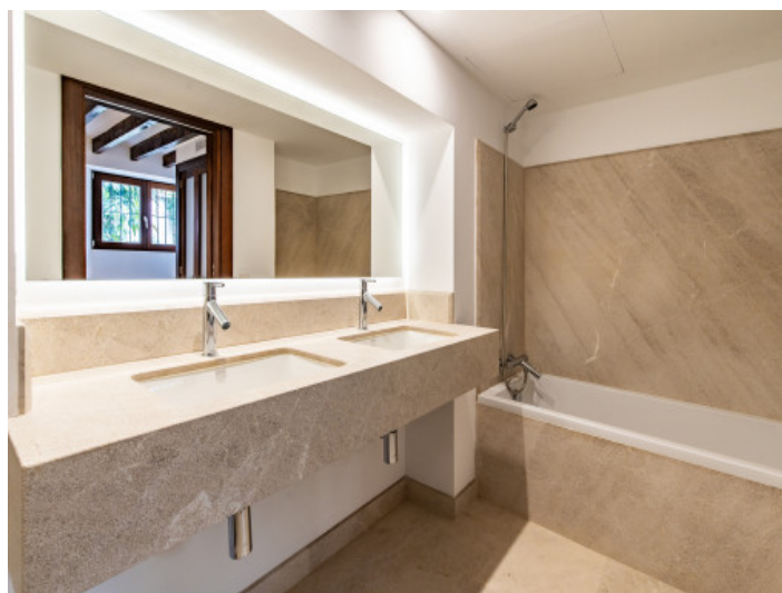
One of the two bathrooms with a shower and bathtub