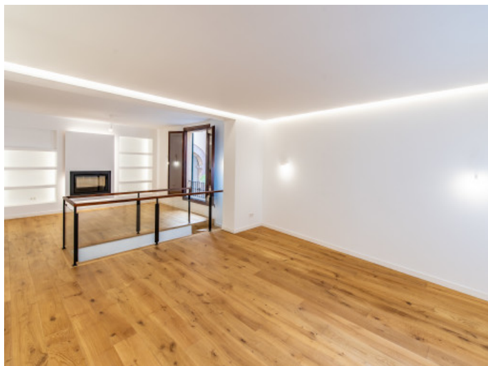
Impressive living and dining area