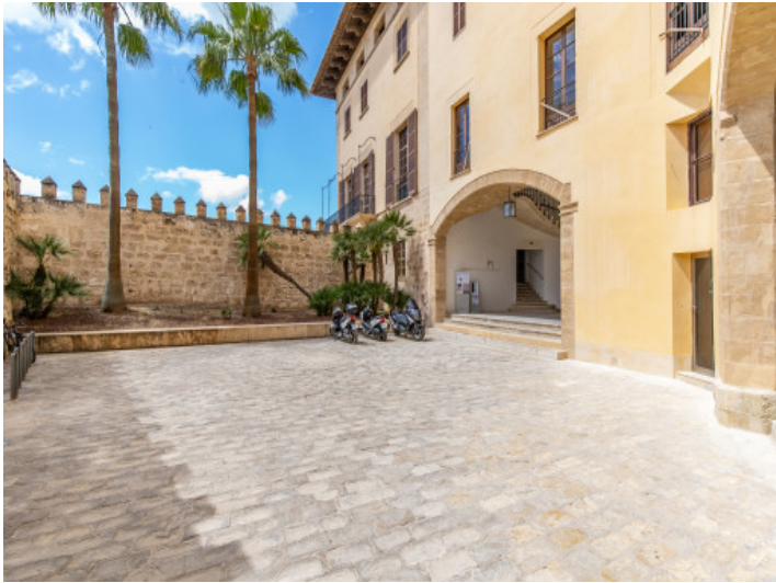
Dreamlike location with a wonderful surroundingsExcellent location at the