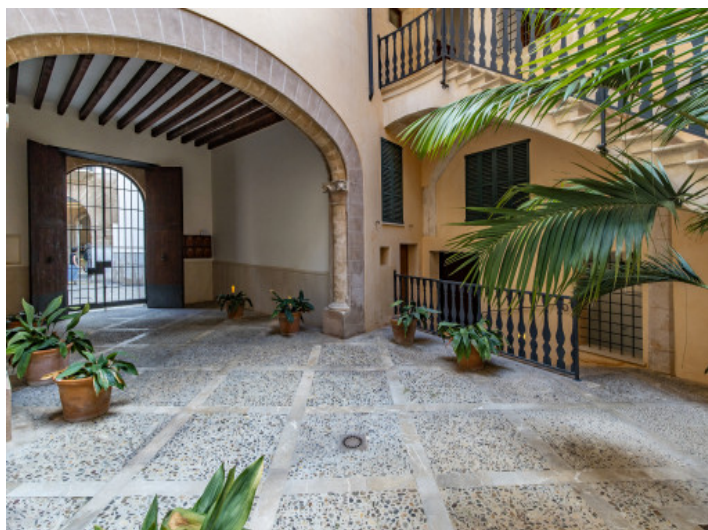
Exclusive old town apartment in a historic palace