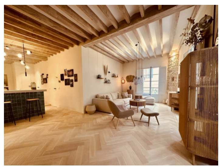
Spacious living area