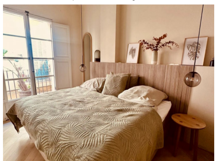
Master bedroom with original ceiling beams Palma marina All information is correct to the best of our knowledge. Errors and prior sale excepted. This prospectus is purely for information purposes. Only the notarized deed of sale is legally binding.

PORTA MALLORQUINA • THERESIENSTR.: 81, 80333 MUNICH TEL. +34 971 698 242 • INFO@PORTAMALLORQUINA.COM