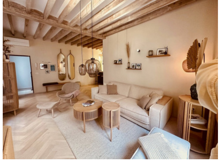
Renovated old town apartment with traditional design elements

PORTA MALLORQUINA® Your home. Our passion.