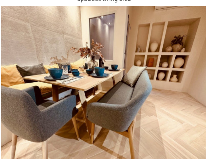
Cozy dining nook