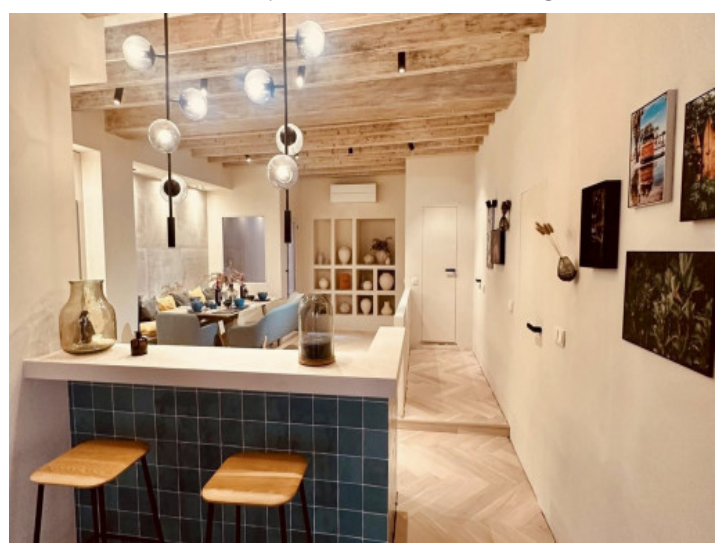
Open kitchen and dining area