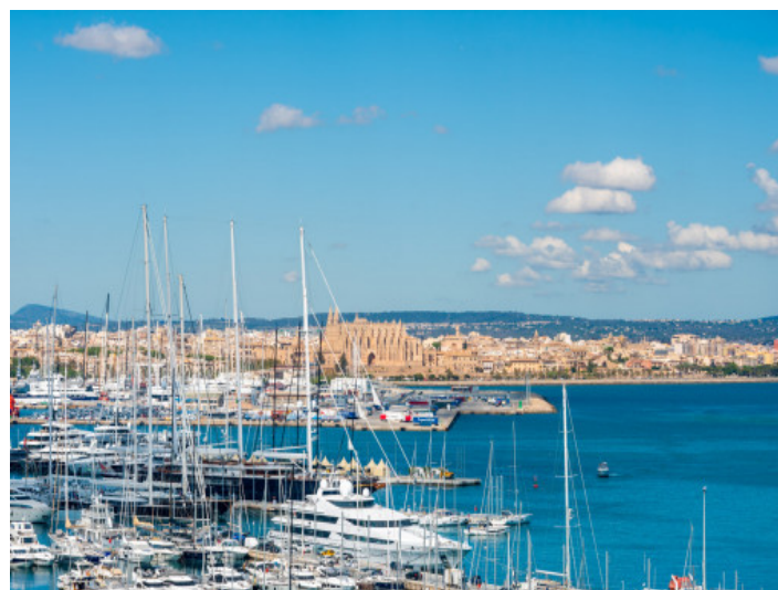
View to harbour