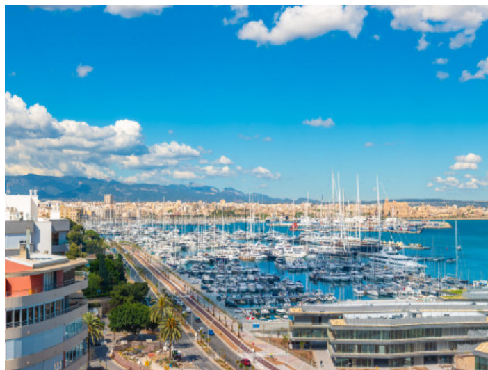
View to harbour