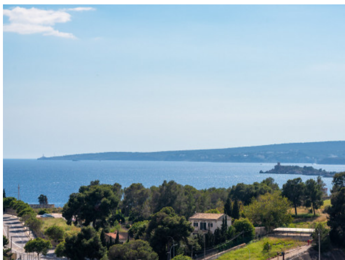
View to Portopí