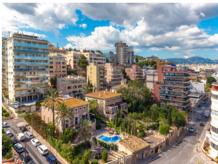
View to Bonanova