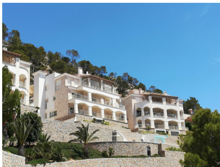
View of the complex