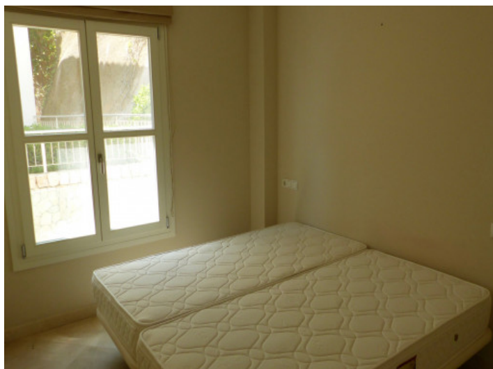
One of two bedrooms

All information is correct to the best of our knowledge. Errors and prior sale excepted. This prospectus is purely for information purposes. Only the notarized deed of sale is legally binding.