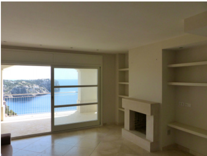
Bright and airy living area