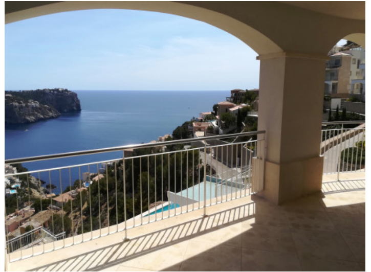
Terrace with fantastic views