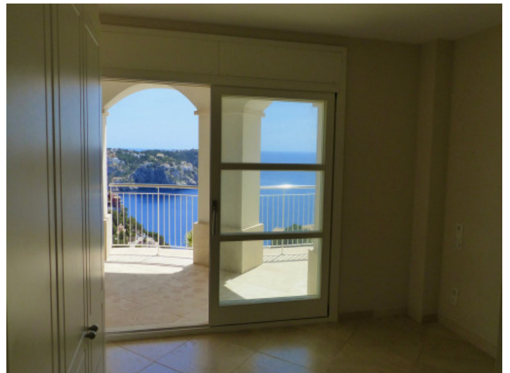
One of two bedrooms