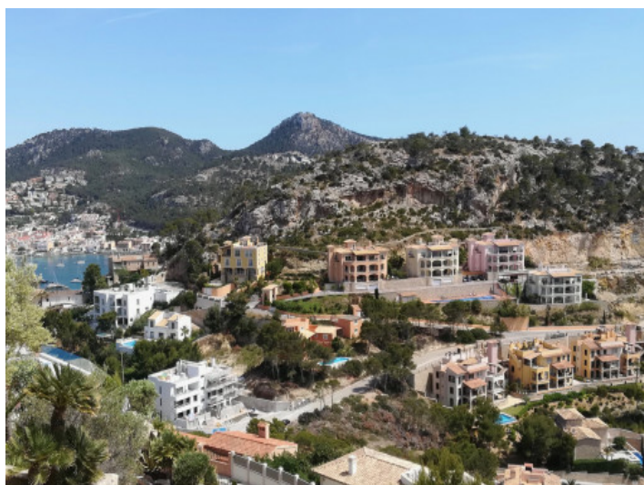
View of Andratx