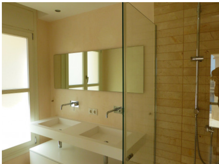
One of two bathrooms