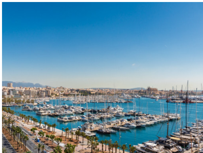
View to Paseo Marítimo