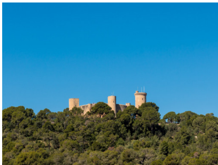
View to castle Bellver

All information is correct to the best of our knowledge. Errors and prior sale excepted. This prospectus is purely for information purposes. Only the notarized deed of sale is legally binding.