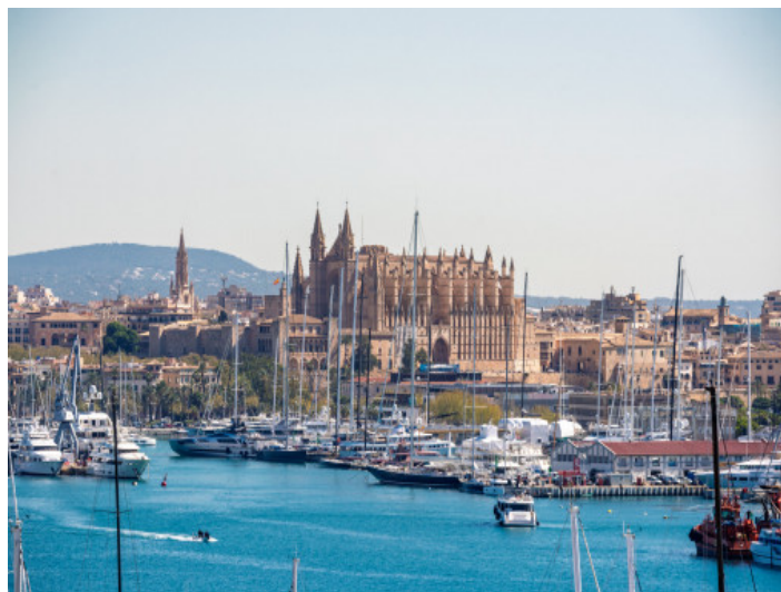
View to cathedral