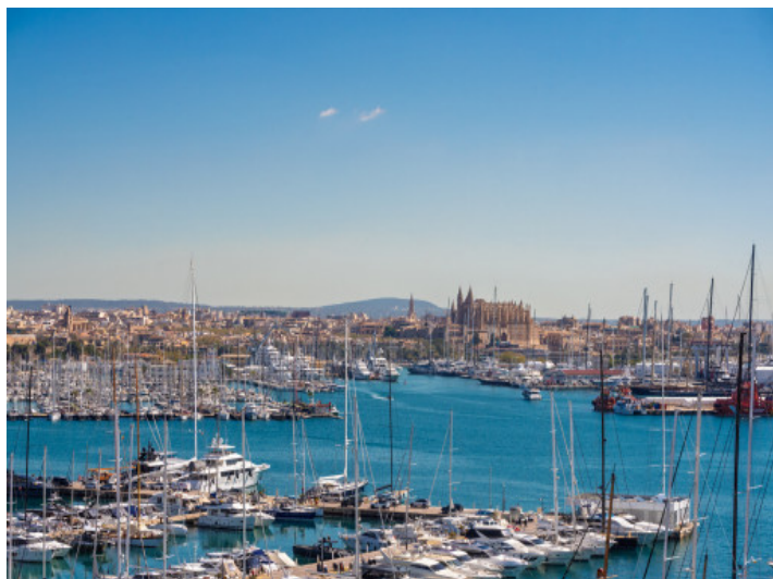
View to harbour