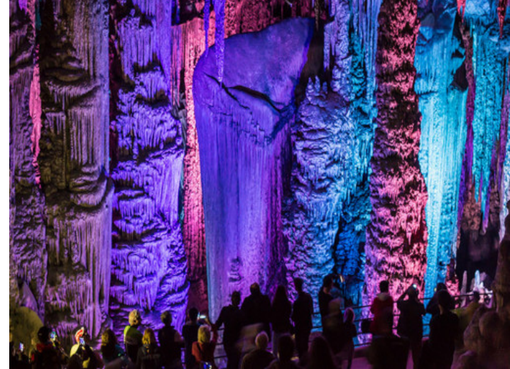
Surroundings Surroundings All information is correct to the best of our knowledge. Errors and prior sale excepted. This prospectus is purely for information purposes. Only the notarized deed of sale is legally binding.

PORTA MALLORQUINA • THERESIENSTR.: 81, 80333 MUNICH TEL. +34 971 698 242 • INFO@PORTAMALLORQUINA.COM