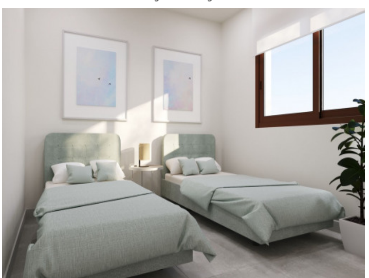
Elegant double bedroom Double bedroom All information is correct to the best of our knowledge. Errors and prior sale excepted. This prospectus is purely for information purposes. Only the notarized deed of sale is legally binding.