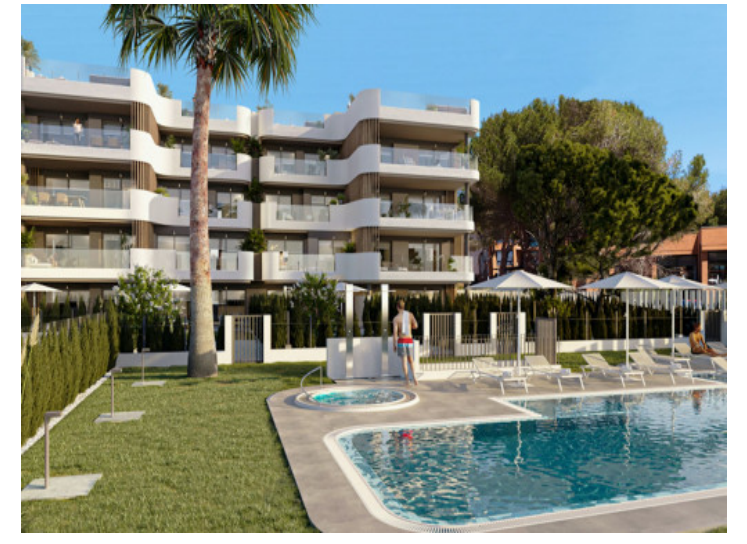
Modern, stylish 3-bedroom apartment with spacious outdoor areas in Cala