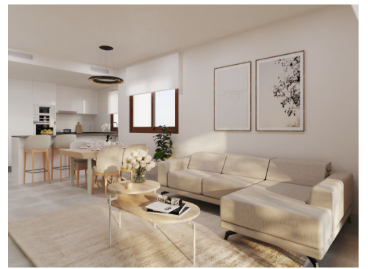
Living and dining area Living and dining area All information is correct to the best of our knowledge. Errors and prior sale excepted. This prospectus is purely for information purposes. Only the notarized deed of sale is legally binding.