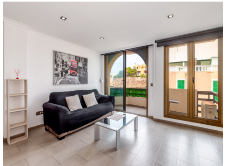
Living room with access to the balcony