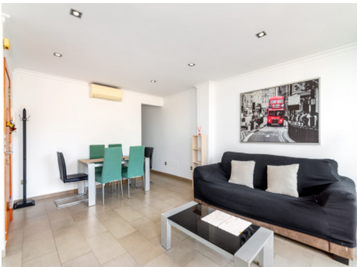
Open plan living and dining area