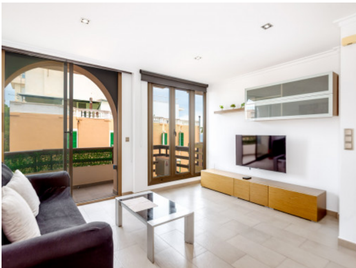
Light-flooded living room