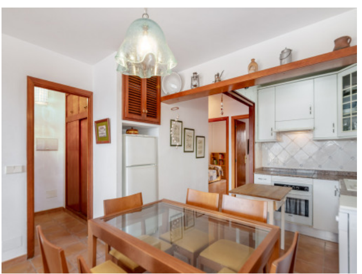
Living area and kitchen Living area and kitchen All information is correct to the best of our knowledge. Errors and prior sale excepted. This prospectus is purely for information purposes. Only the notarized deed of sale is legally binding.