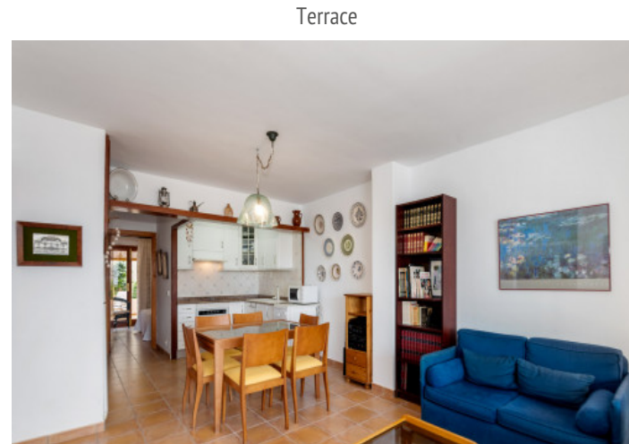
Living area and kitchen