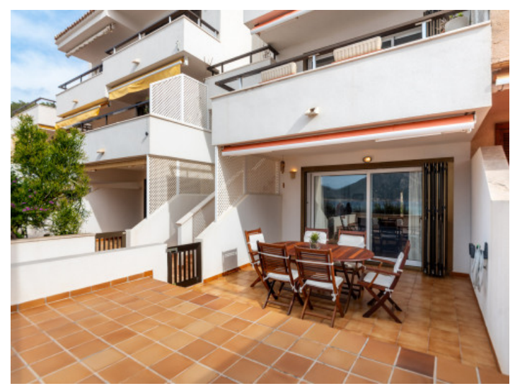
Sea view terrace