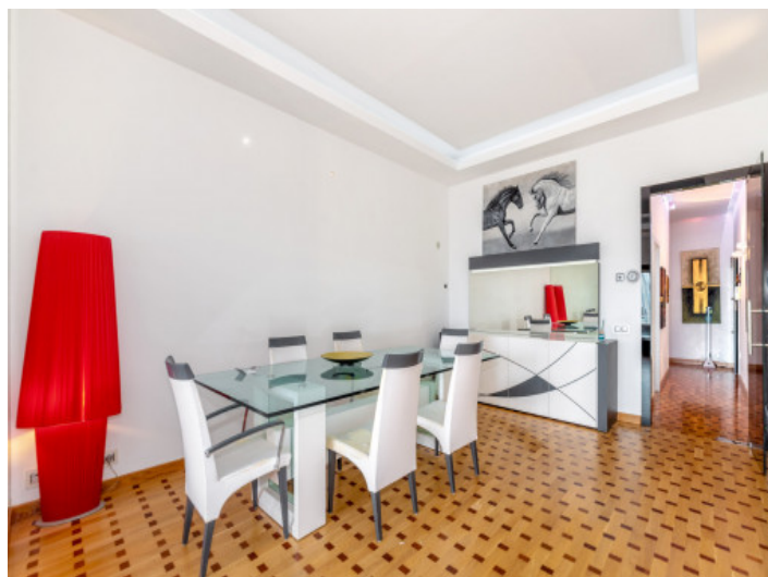
Dining area and kitchen

All information is correct to the best of our knowledge. Errors and prior sale excepted. This prospectus is purely for information purposes. Only the notarized deed of sale is legally binding.