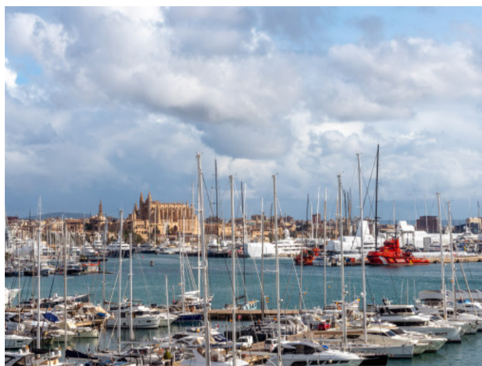
Views to the harbour and the cathedral