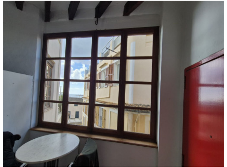
Entrance and view

All information is correct to the best of our knowledge. Errors and prior sale excepted. This prospectus is purely for information purposes. Only the notarized deed of sale is legally binding.