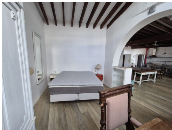
Sleeping area and desk