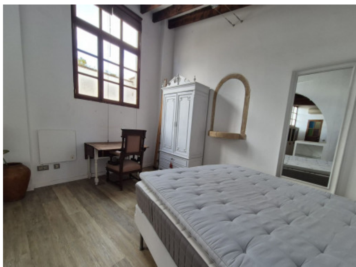
sleepingarea and desk