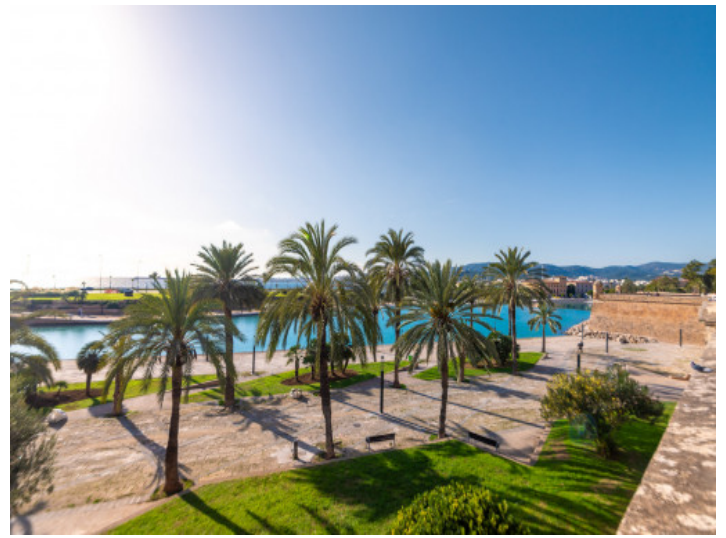
Parc de la Mar