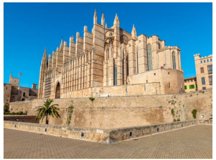
Cathedral La Seu