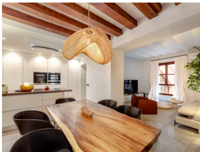
Dining area and kitchen