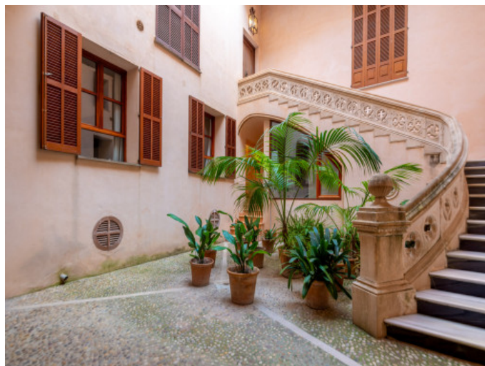
Typical Mallorcan patio