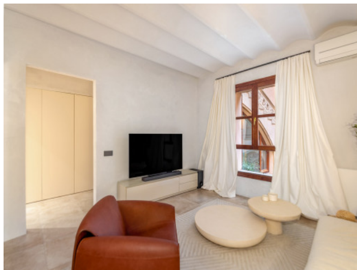
Beautiful living area