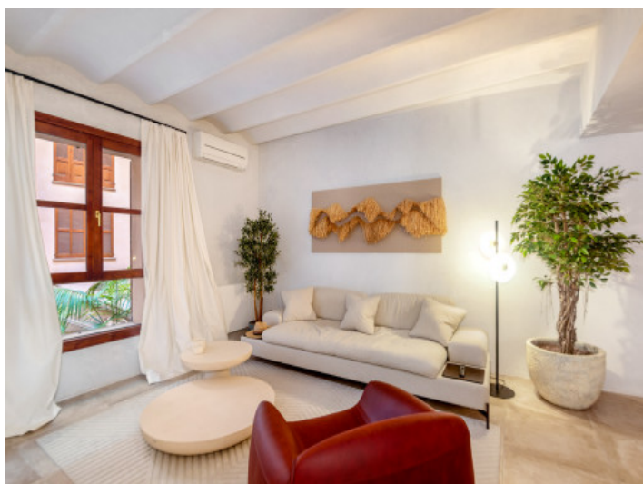
Elegant living area