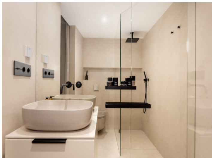
Modern bathroom with walk in shower