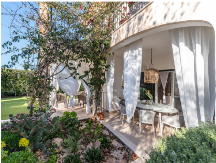
Terrace and garden