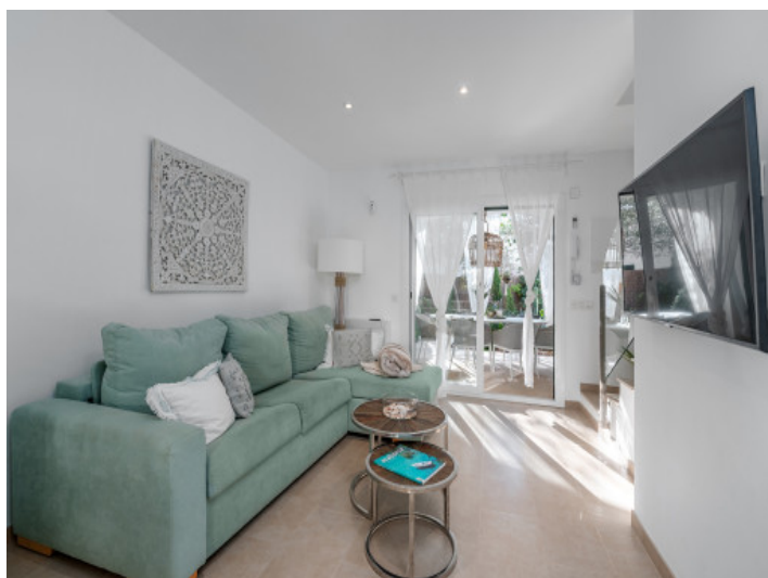
Light-flooded living area