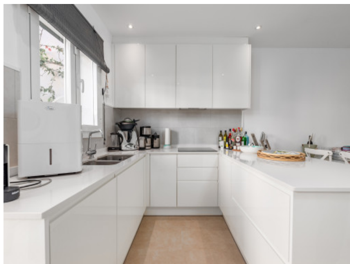
Modern, fully equipped kitchen

All information is correct to the best of our knowledge. Errors and prior sale excepted. This prospectus is purely for information purposes. Only the notarized deed of sale is legally binding.