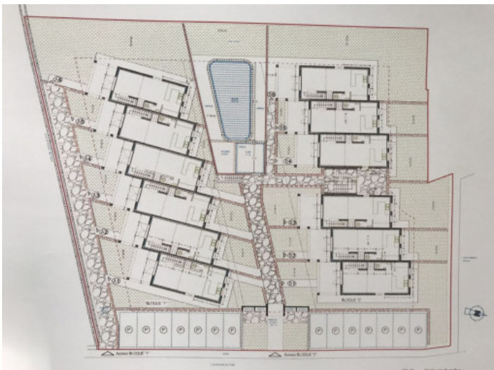
Plan residential complex