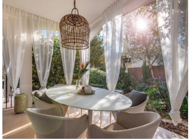
Lovely covered terrace