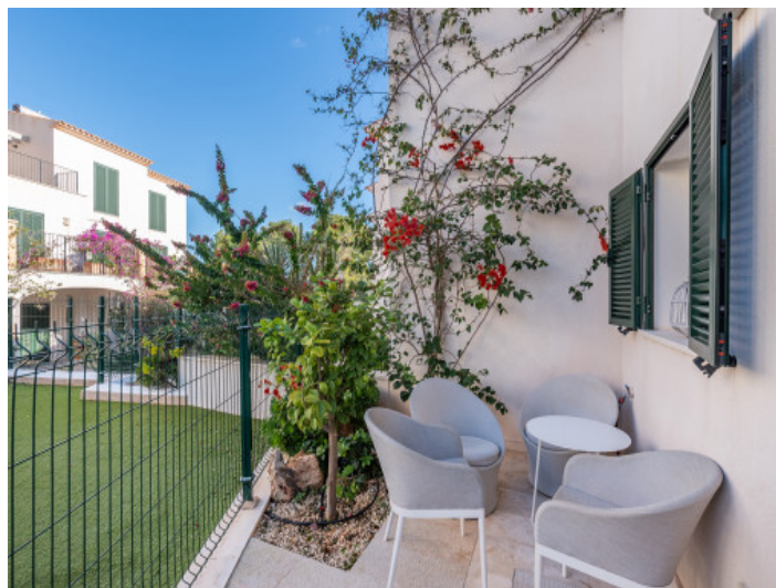
Additional terrace with seating