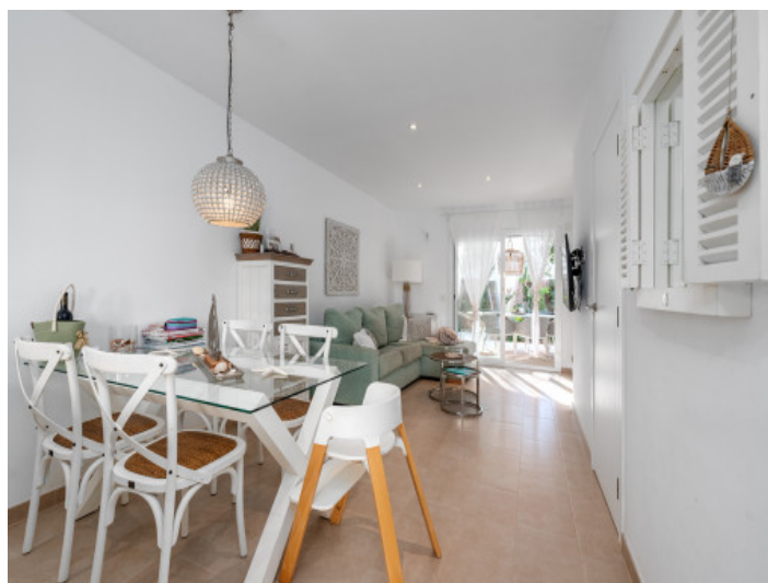
Open plan living and dining area