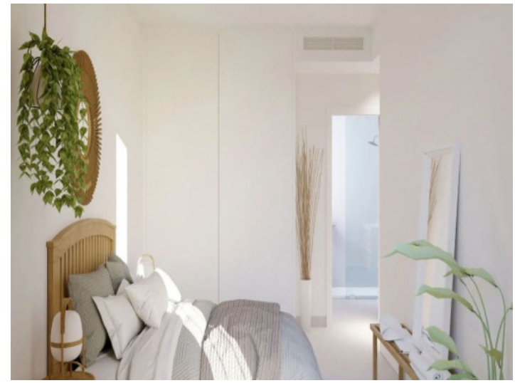
One of 3 bedroom