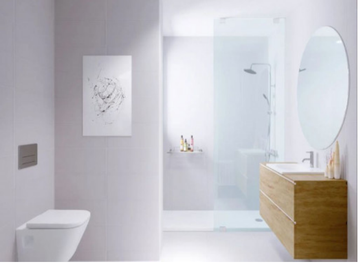
Flat with 2 bathrooms

All information is correct to the best of our knowledge. Errors and prior sale excepted. This prospectus is purely for information purposes. Only the notarized deed of sale is legally binding.