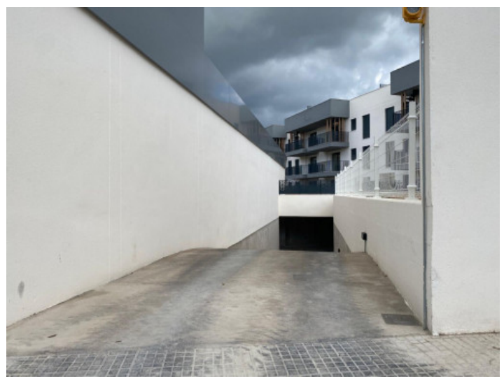
Access to the underground parking