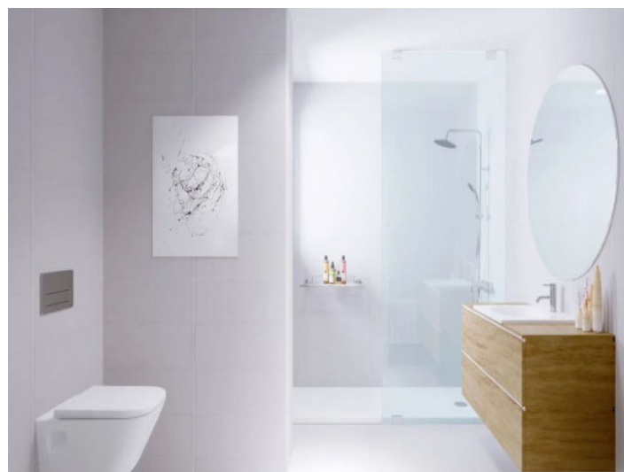
Flat with 2 bathrooms