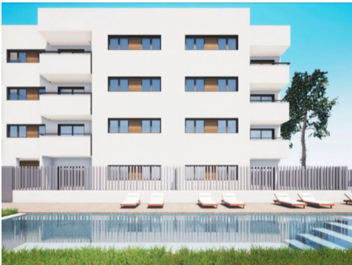
Penthouse with pool in Cala Ratjada