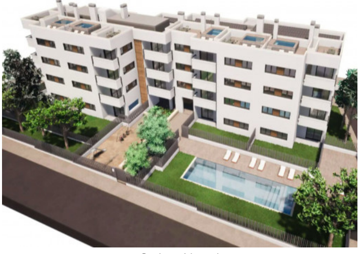
Garden with pool

All information is correct to the best of our knowledge. Errors and prior sale excepted. This prospectus is purely for information purposes. Only the notarized deed of sale is legally binding.