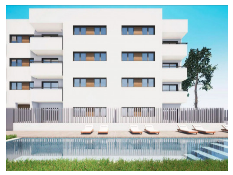
Penthouse with private pool in Cala Ratjada