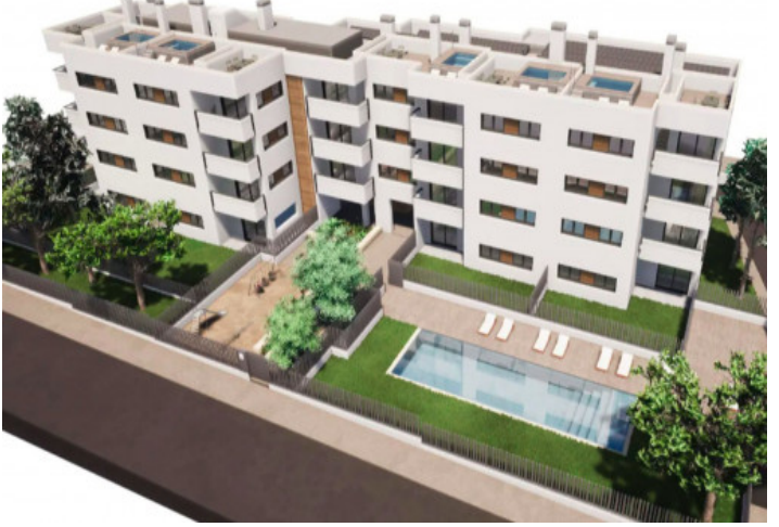
Garden with pool

All information is correct to the best of our knowledge. Errors and prior sale excepted. This prospectus is purely for information purposes. Only the notarized deed of sale is legally binding.