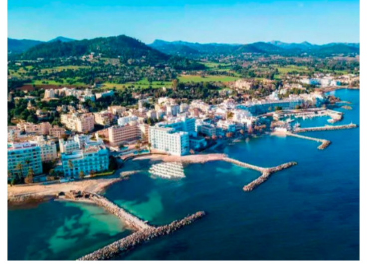
Modern condominiums in Cala Bona - living in an attractive location near

PORTA MALLORQUINA® Your home. Our passion.