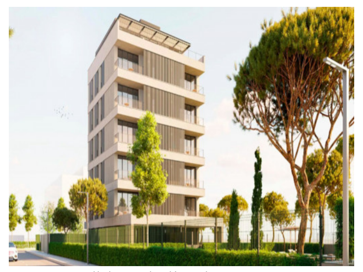
Underground parking and storage room