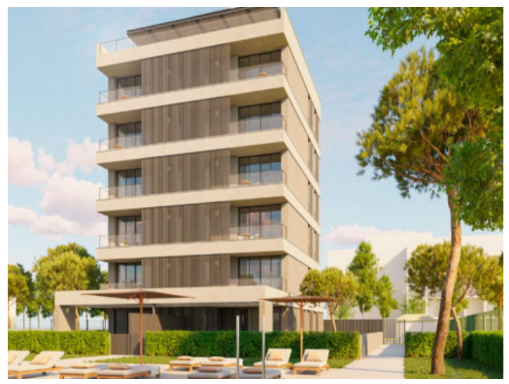
Newly - built