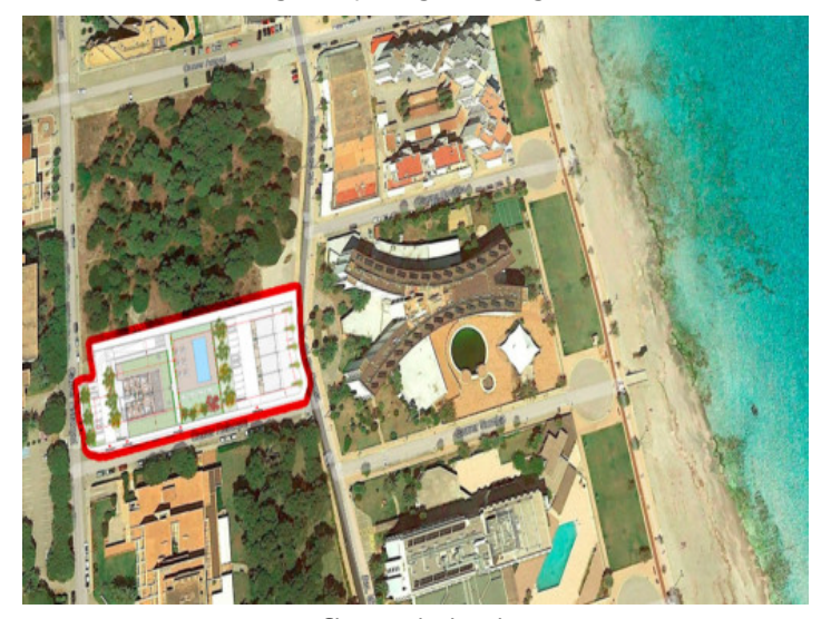
Close to the beach