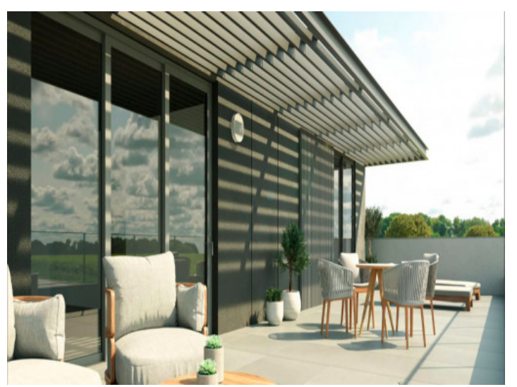
Flat with 3 bedrooms and 2 bathrooms