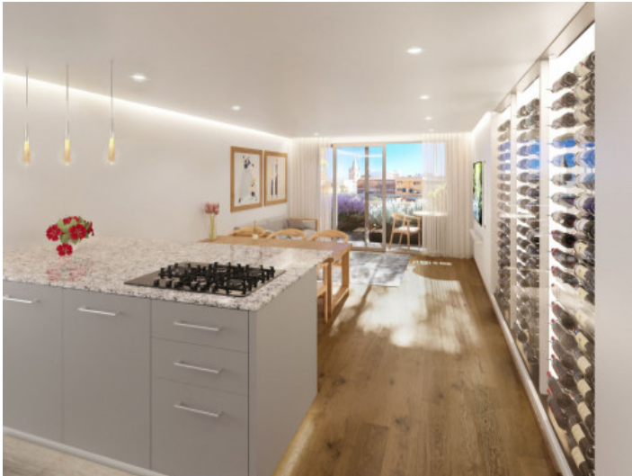
Central city location