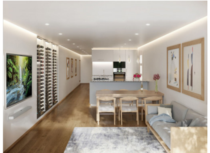
Cozy living and dining area