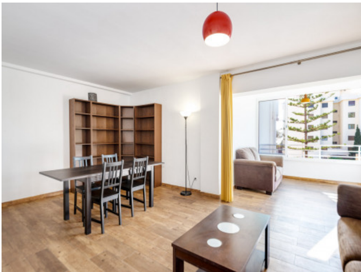
Light-flooded living and dining area