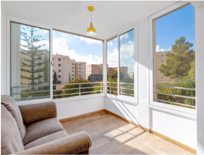
Apartment in a prime location in Portals Nous